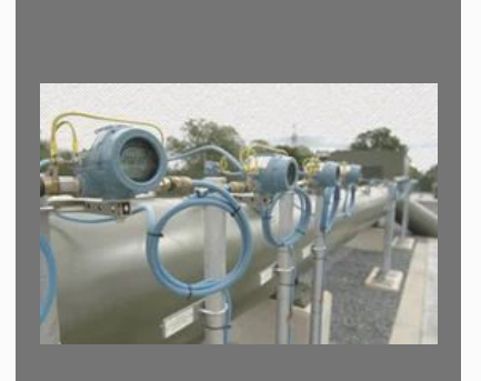
Electrical & Instrument Engineering