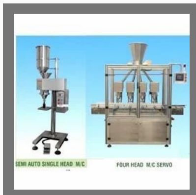
Fully Automatic Auger Metric Powder Filling Machine