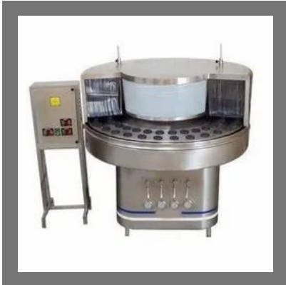
Bottle Washing Machine