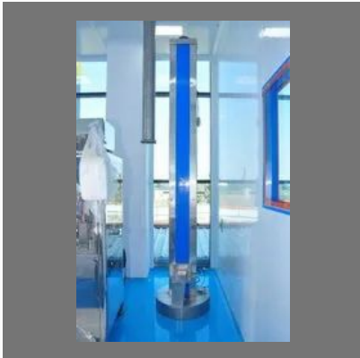
Lifting & Positioning Devices