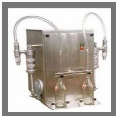
Semi Auto Volumetric Liquid Filling Machine