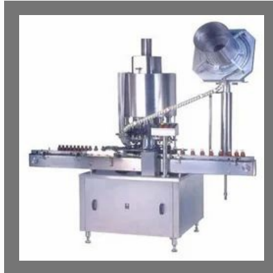
Fully Automatic ROPP Capping Machine