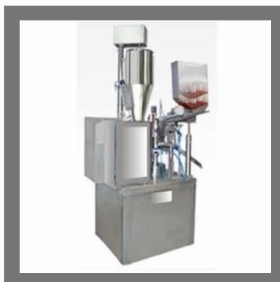
Automatic Tube Filling Machine