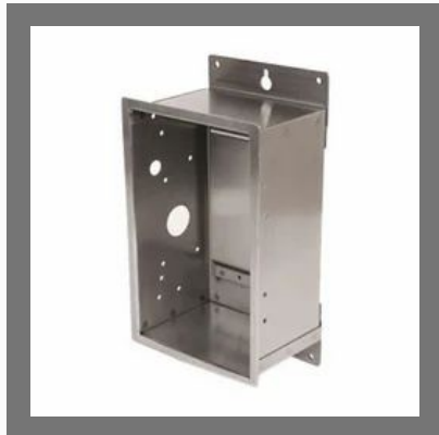
Sheet Metal Fabrication Work