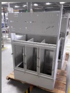
Switch Gear Panels