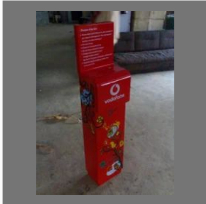
Sheet Metal Pressed Components