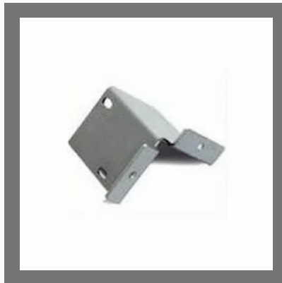
CNC Sheet Metal Bending