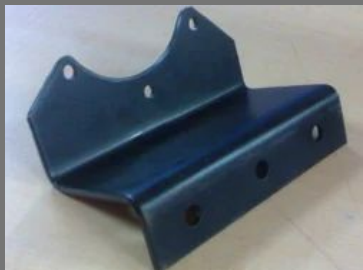
Sheet Metal Bending