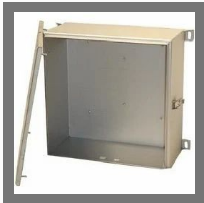
Sheet Metal Components