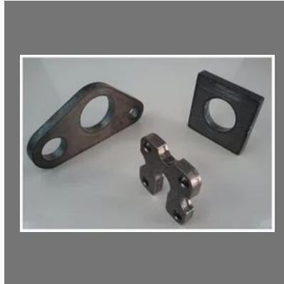
Laser Cutting Components