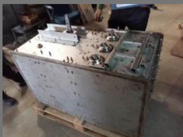
GIS- SS Tank