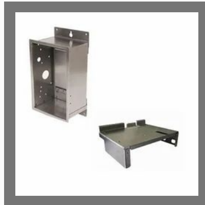
Sheet Metal Parts