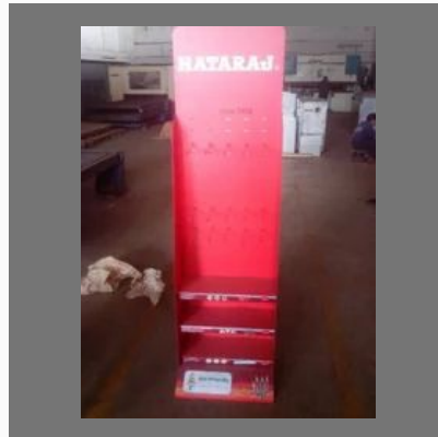
Display Racks Of Sheet Metal