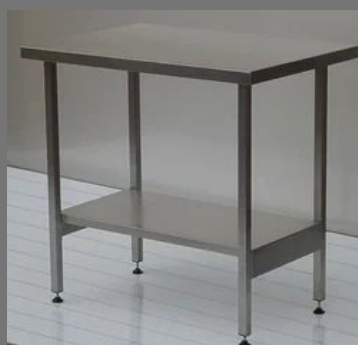
Stainless Steel Tables Fabrication Work