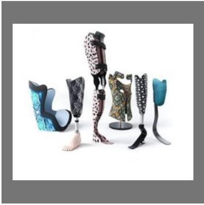
Prosthetic and Orthotic services