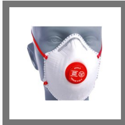
Venus Masks CV N-95 Mask and Respirator