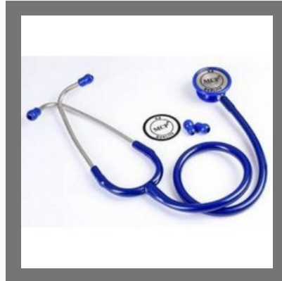
MCP Dual Head Blue Stethoscope