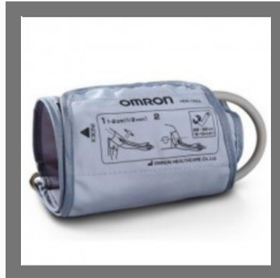
Omron Regular Blood Pressure Monitor Cuff