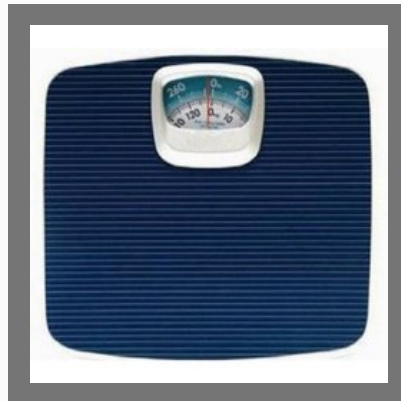
Personal Weighing Scale Analog Mechanical