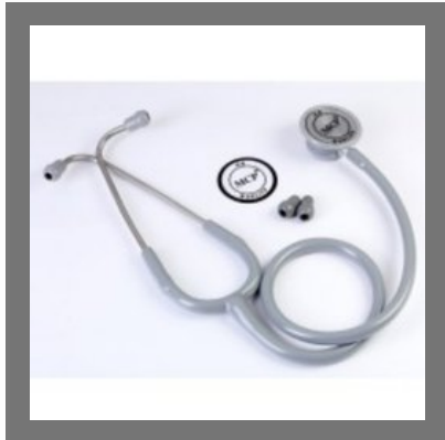
MCP Dual Head Grey Stethoscope