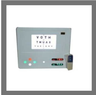
Remote Control Distance Eye Vision Testing Drum