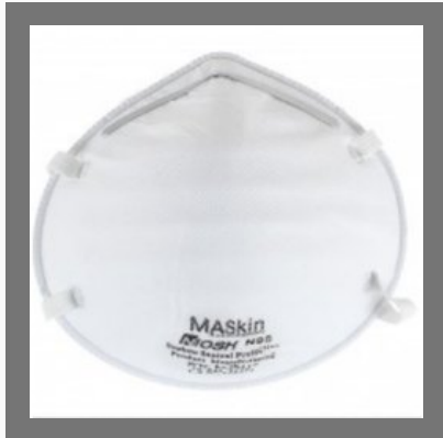
N 95 Maskin Niosh Swine Flu Mask