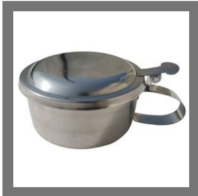
Stainless Steel Spitting Mug