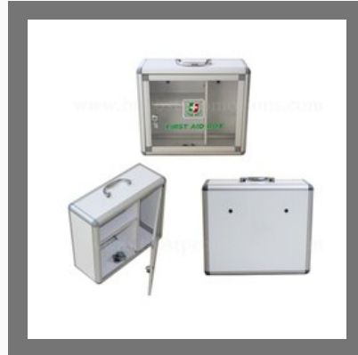
Wall Mounted First Aid Box