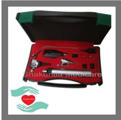
Ent Diagnostic Complete Set with Ophthalmoscope and Otoscope