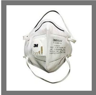
3M 9004V Valved Anti Pollution Respirator Mask