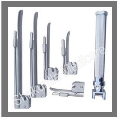
LED Laryngoscope Set