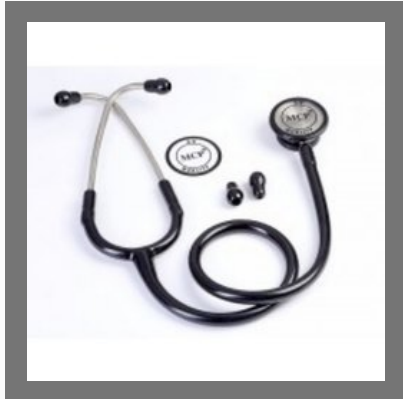
MCP Black Dual Head Stethoscope