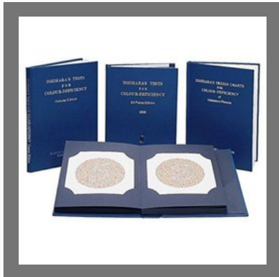
Ishihara Colour Vision Test Book For Color Deficiency