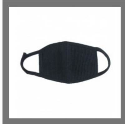
Anti Pollution Protective Face Mask