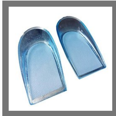
Rehab Cushions Heel Cup