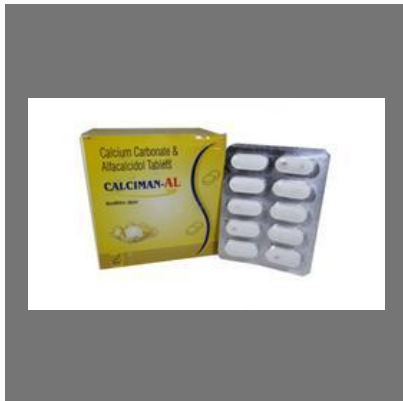
Calciman AL Tablets