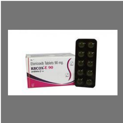
Rbcox E90 Tablets