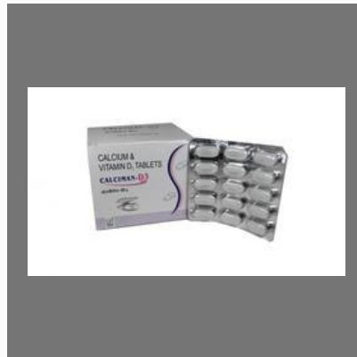
Calciman D3 Tablets