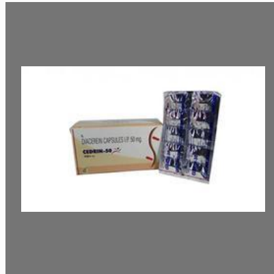
Cedrin - 50 Capsules