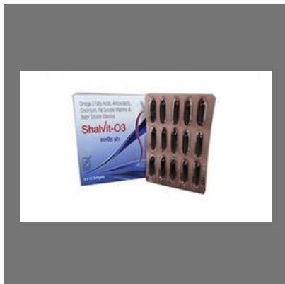
Shalvit O3 Softgels Capsules