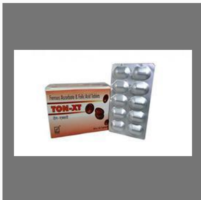
Ton Xt Tablets