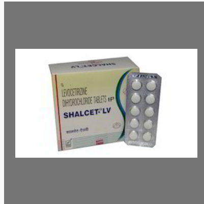
Shalcet - LV Tablets