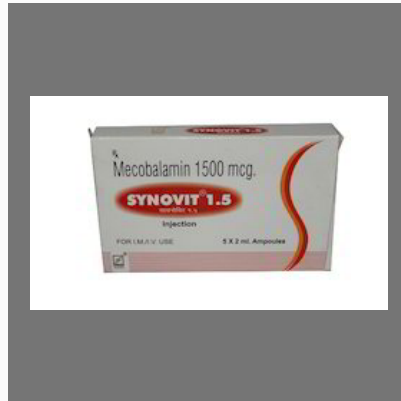
Synovit 1.5 Injection