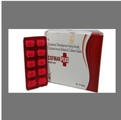
Cofman Plus Tablets