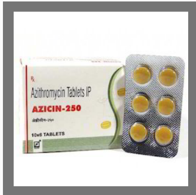
Azicin 250 Tablets