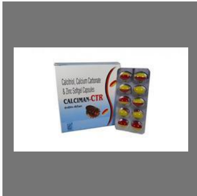
Calciman CTR Softgels Capsules