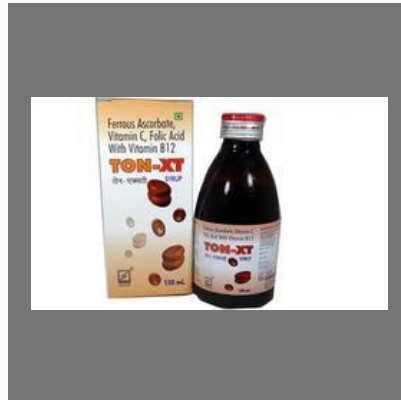
Ton XT Syrup