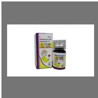
Azicin 200 Suspension