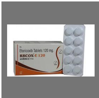
Rbcox E120 Tablets