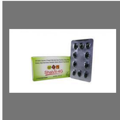
Shalvit 4g Softgels Capsules