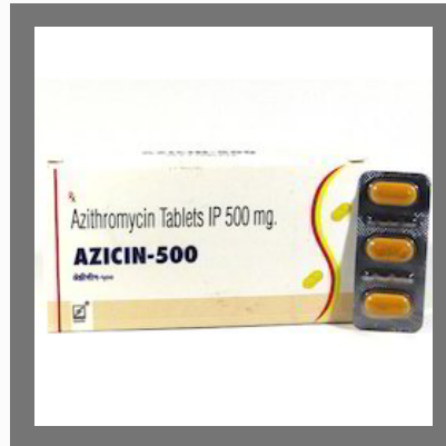
Azicin 500 Tablets