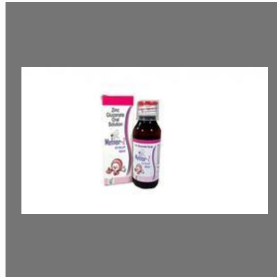
Metnor - Z Syrup