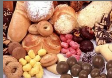
Standard Soya Lecithin