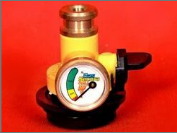
Hydrolyzed Soya Lecithin