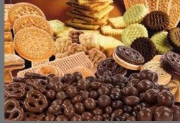
Standard Sunflower Soya Lecithin