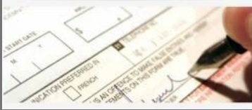
Internal and Management Audits