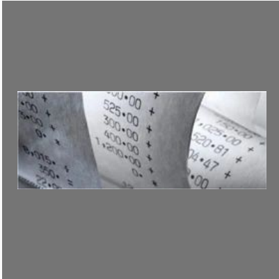
Statutory Bank Branch Audit