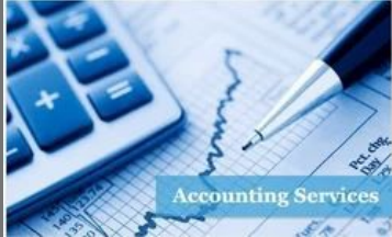
Accounting & Related Consultancy Services