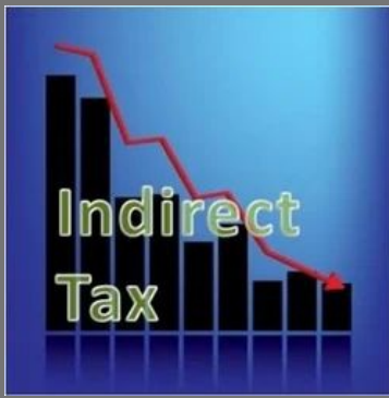
Direct & Indirect Taxation Services