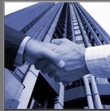
Corporate Finance Services