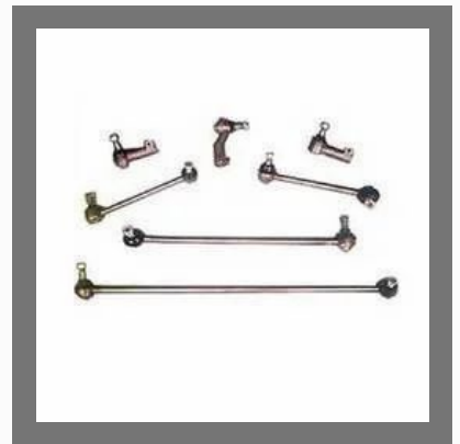
Auto Tie Rod End