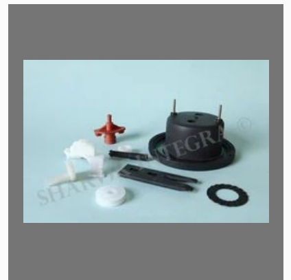
Industrial Plastic Parts