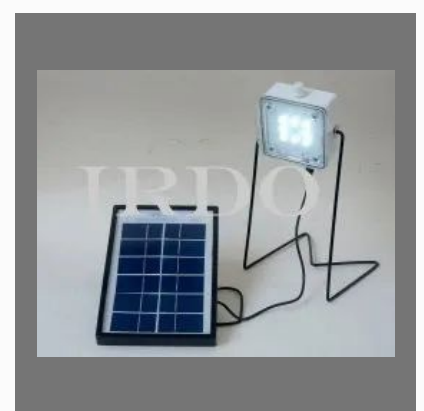
Solar Lamp for CSR , NGO and Disaster Relief