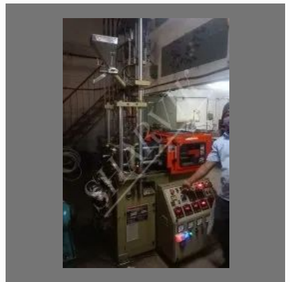
Injection Moulding Services For Industrial Parts