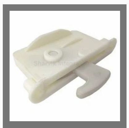
SIP Panels Camlock