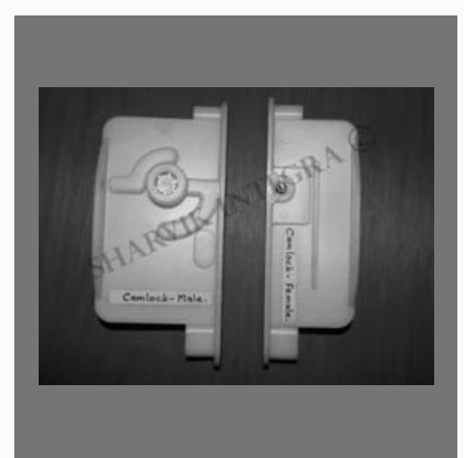
Plastic Cam Lock