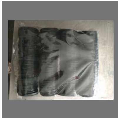
Rubber Grip Pack