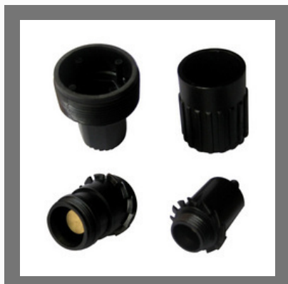
Automotive Interior Decorate