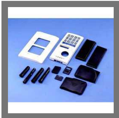
Injection Moulded Automobile Parts