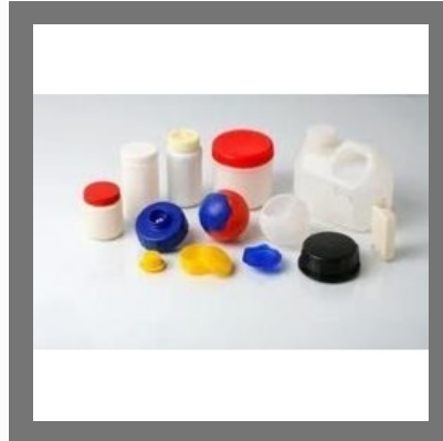
Industrial Plastic Components