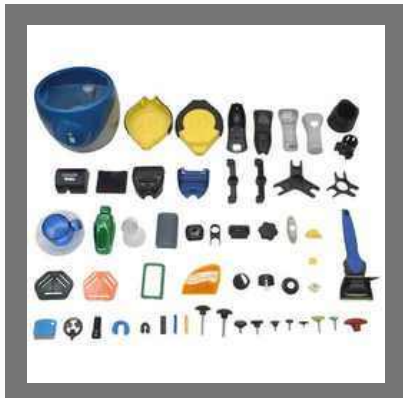
Custom Injection Moulding