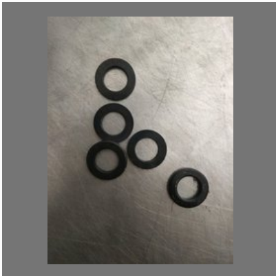
Thin Fluid Grip Washers