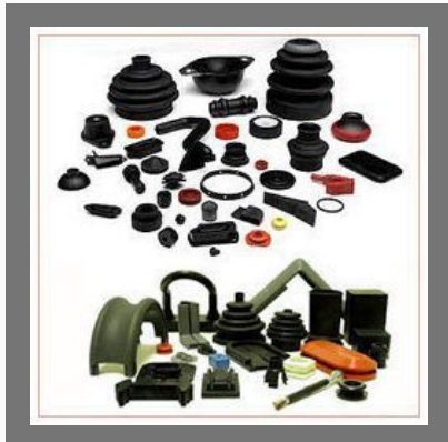
Plastic Moulded Products