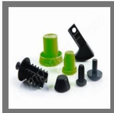
Injection Moulded Plastic