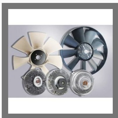
Commercial Vehicle Components