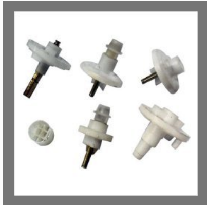
Electrical Plastic Components