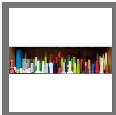
Plastic Molded Parts