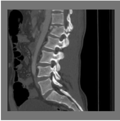
Fracture Spine Treatment Services