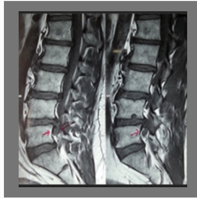
Lumber Spine Treatment Services