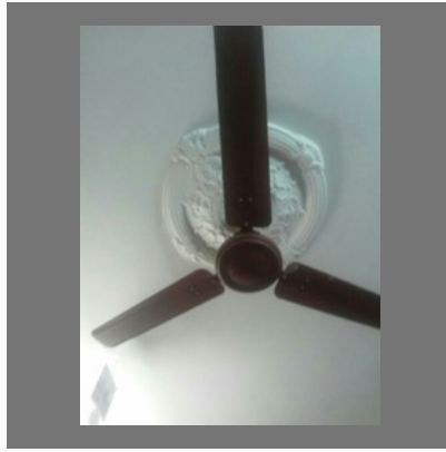
Black Fast Fans Service