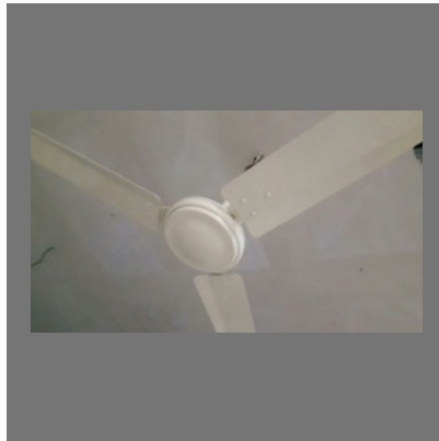
White Coloured Ceiling Fans Service