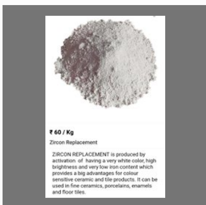
Zircon Replacement 50kg Bag Regular Completely Products