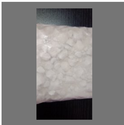
China Clay 50kg Bag Regularly Completely Products