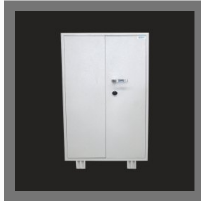
Baby Storewell Cupboard