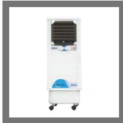
Vivo 150 Commercial Air Cooler