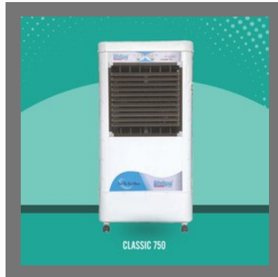
Classic 750 Air Coolers