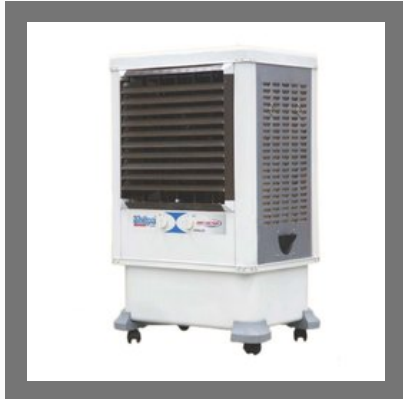
Nova 270 Commercial Air Cooler