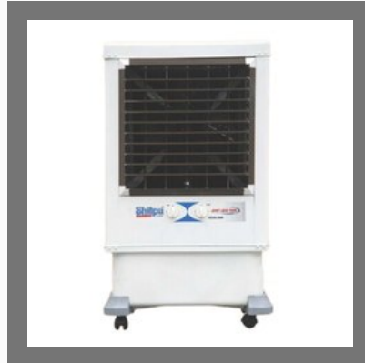
Nova 300 Commercial Air Cooler