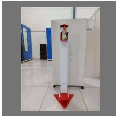
Pedlock MS Foot Operated Hand Sanitizer Dispenser