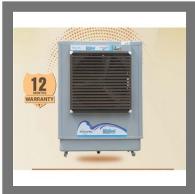
IND 2500 Air Cooler