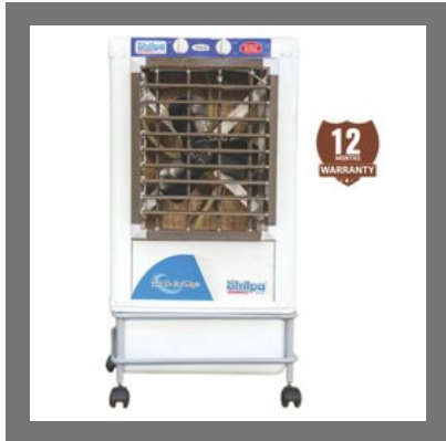
Tent Air Cooler Bobby 200