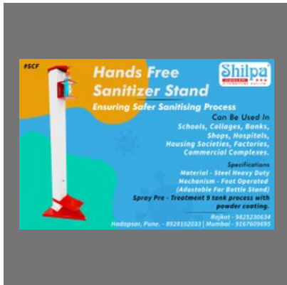
Manual Hand Sanitizer Dispenser