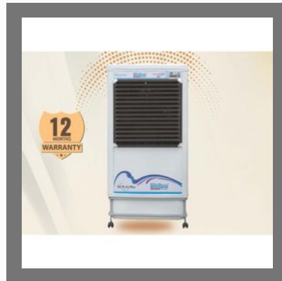
Electrical Panel Industrial Air Cooler