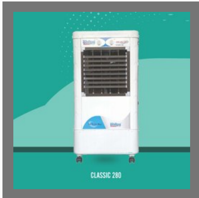
Classic 280 Air Coolers