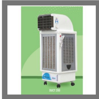
Duct Air Cooler