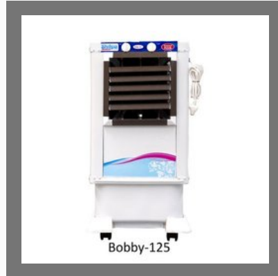
Tent Cooler Bobby 125