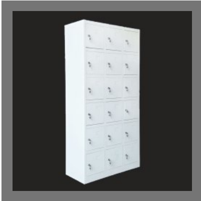
Metal Storage Office Locker