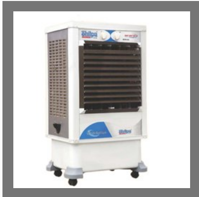
Nova 325 Commercial Air Cooler