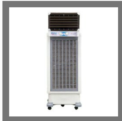
Duct 450 Air Cooler