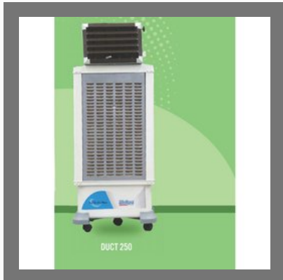
Duct 250 Air Cooler