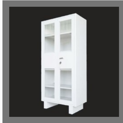
Glass Door Library Bookcase