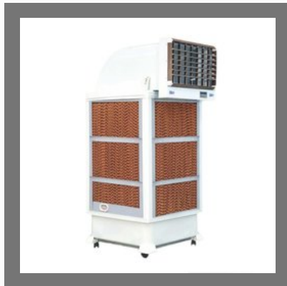
Duct 800H Air Cooler