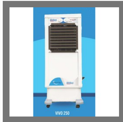
Vivo 250 Commercial Air Cooler