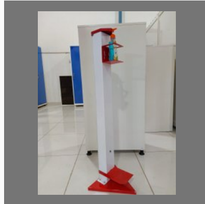
Foot Operated Hand Sanitizing Stand