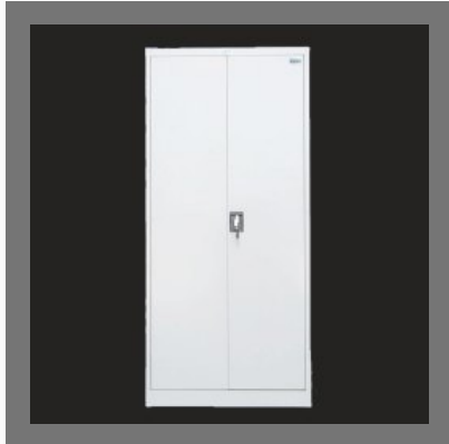
Office Storewell Cupboard - Two Door