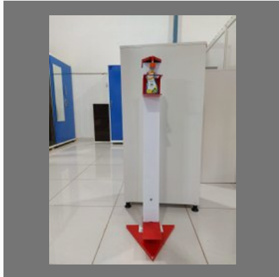
Foot Press Hand Sanitizer Stand