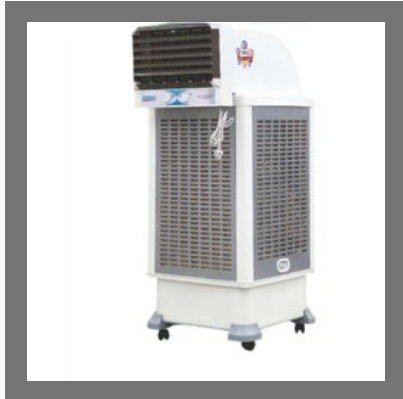
Duct Air Cooler 325