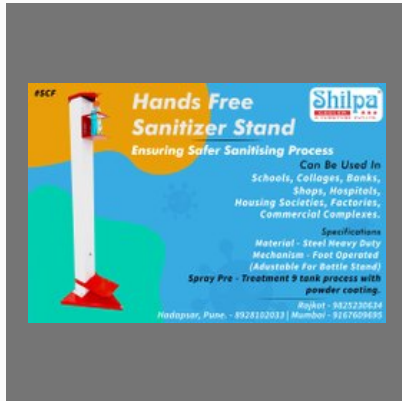
Hands Free Sanitizer Stand