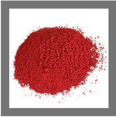
Mercuric Iodide Red