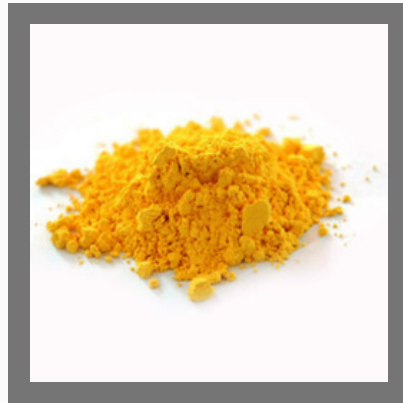
Mercuric Oxide Yellow