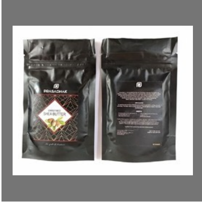
Unrefined Shea Butter