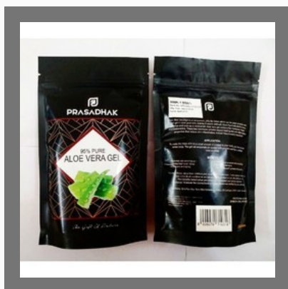
Pure Aloe Vera Gel