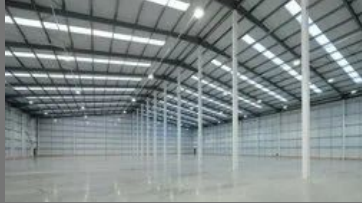
Steel Heavy Industrial Sheds