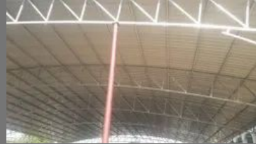
Metal Panel Build Industrial Sheds