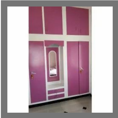
Color Coated Steel Almirah