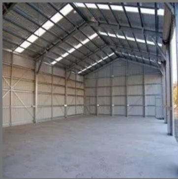
11 Feet Industrial Sheds