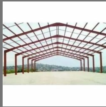
Panel Build Prefabricated Industrial Sheds