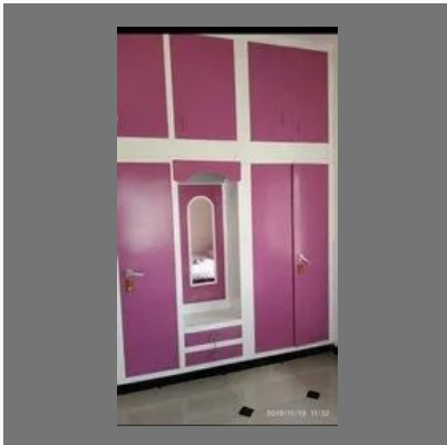
Godrej Steel Almirah