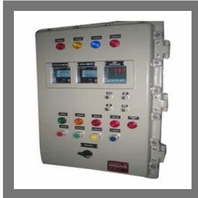
Flameproof Control Panels