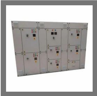
Electric Control Panel