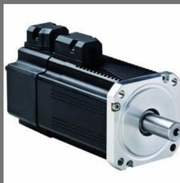
AC Servo Motor