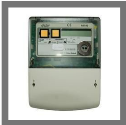
Electric Single Phase Meter