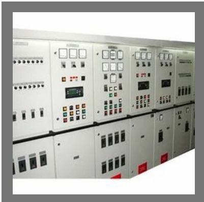
Three Phase Control Panel