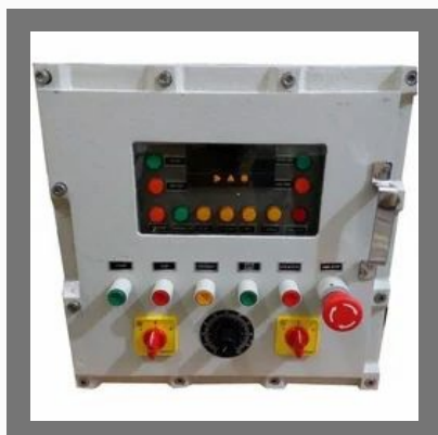
Flameproof Control Panel