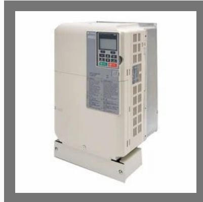
Yaskawa A1000 VFD, 0.75 kW to 655 kW, 1/3 Phase