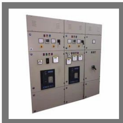
HT Control Panels