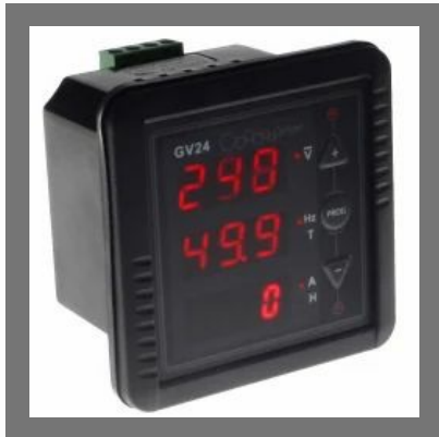
Electric Multifunction Meter