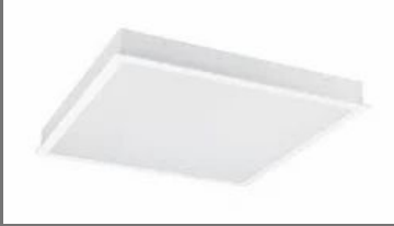
LED surface mount