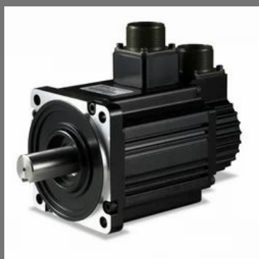
AC Servo Motor