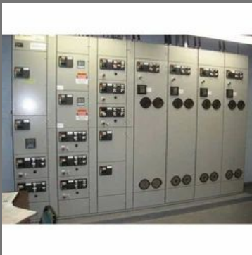
Electrical Control Panel