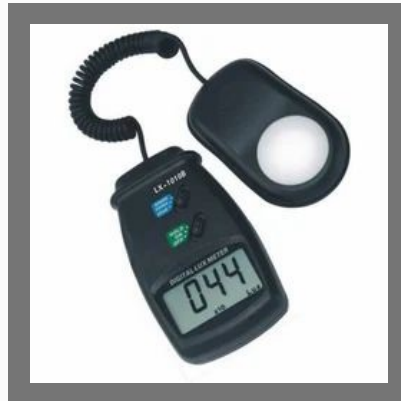
Digital Lux Meter