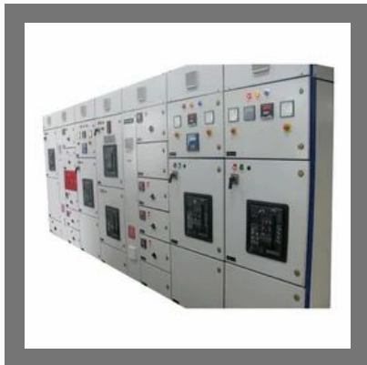
Electrical Switch Gears