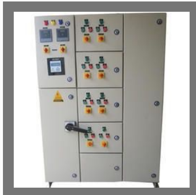
Electrical Control And Power Panel