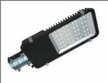
LED Street Light