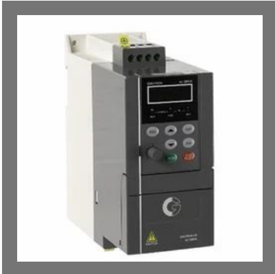
Emotron AC Drives