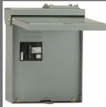
Control Panel Boxes