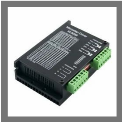
Micro Step Driver