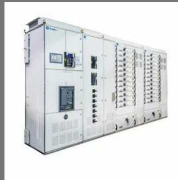
Single Phase Control Panel