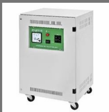
Single Phase Voltage Stabilizer