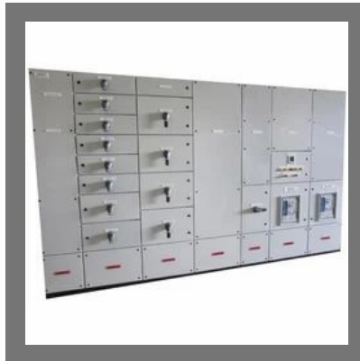
Electric Industrial Switchgear