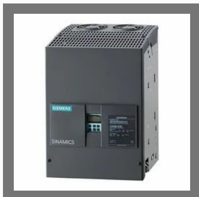
Siemens AC Drives