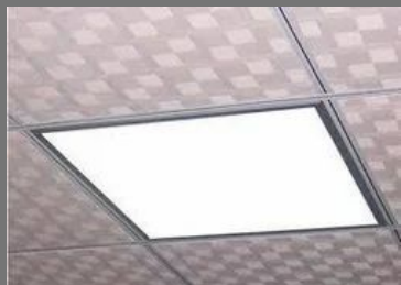
LED Panel lights