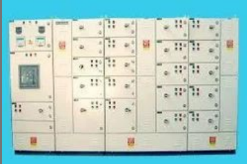
APFC Control Panel