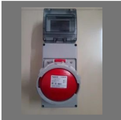
IP 65 Industrial Sockets and Plug