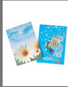
Hard Bound Books