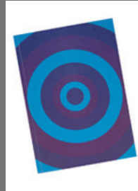
Perfect Bound Book