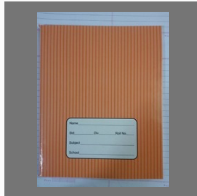
Jumbo Note Book