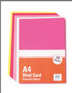
Vivid Colour Cards