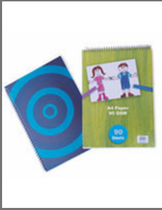
Metal Spiral Books