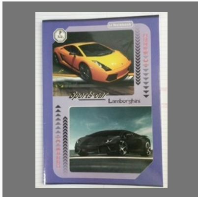
A4 Note Book