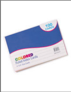
Coloured Ruled Index Cards