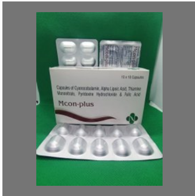
Cyanocobalamin 1500 Mcg, Alpha Lipoic Acid 100 Mg , Pyridoxime 3 Mg & Folic Acid 1.5 Mg