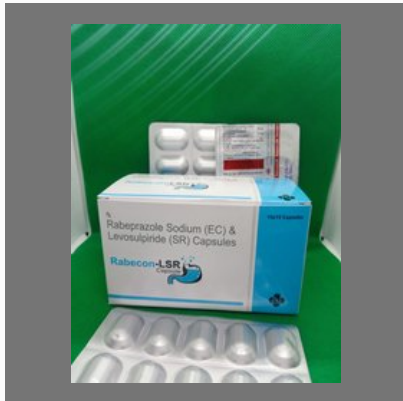
Rabepazole Sodium 20 Mg (Ec) & Levosulpiride 75 Mg (Sr) Capsules