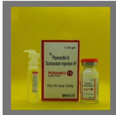
Piperacillin 1000 Mg & Tazobactam 125 Mg Injection