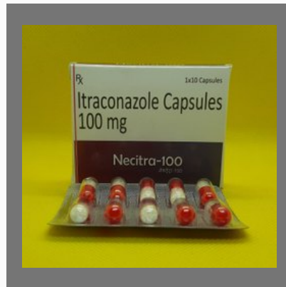
ITRACONAZOLE 100 MG CAPSULES