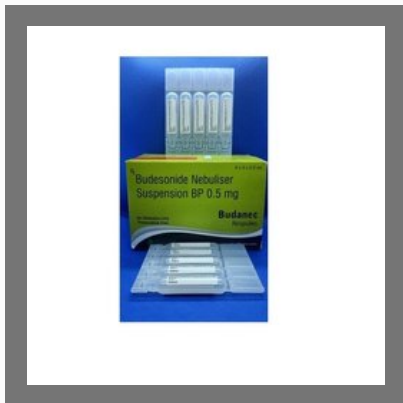
Budanec Budesonide Nebuliser Suspension BP 0.5 mg