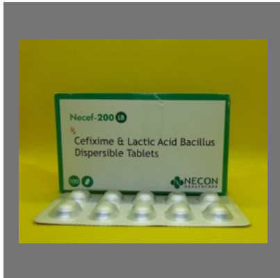
CEFIXIME 200 MG TABLETS