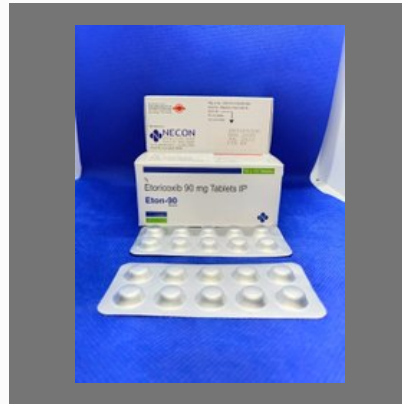
Etoricoxib 90 Mg Tablets