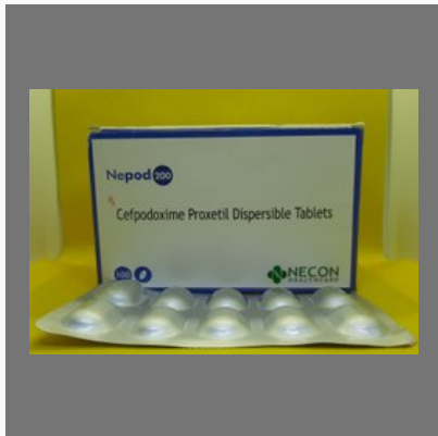
CEFPODOXIME 200 MG TABLET