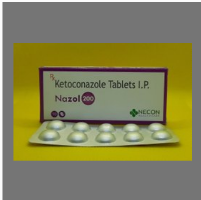
Ketoconazole 200 Mg Tablet