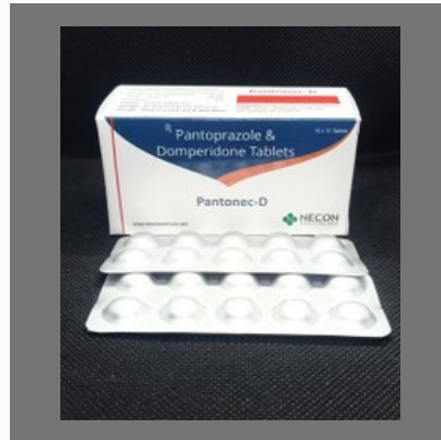
Pantoprazole 40 Mg & Domperidone 10 Mg Tablet