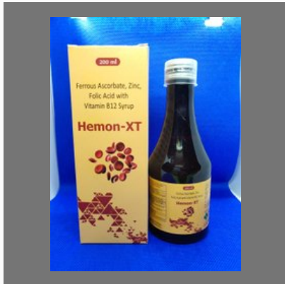
Ferrous Ascorbate, Zinc, Folic Acid With Vitamin B12 Syrup