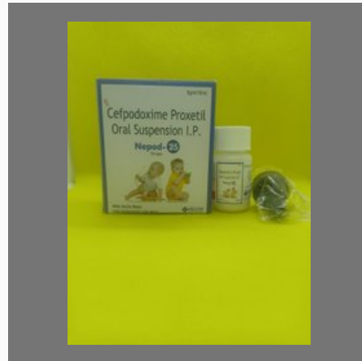
cefpodoxime proxetil 25 mg drop