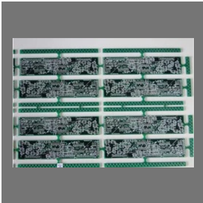
Single Side PCB