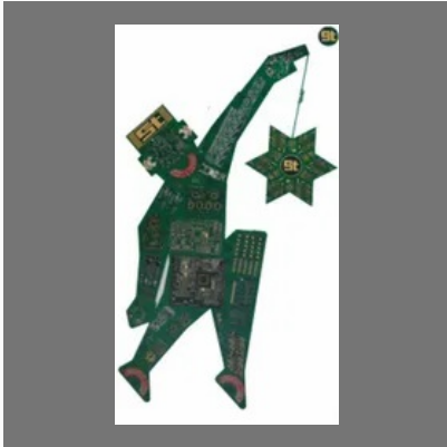
Metal Clad PCBs