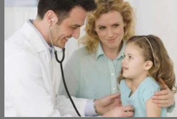
Medicaid Facilities Services