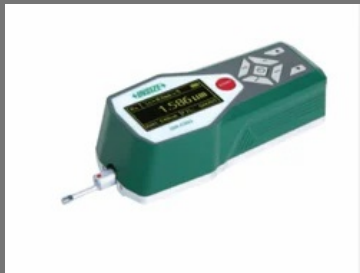
ROUGHNESS TESTER CODE ISR - C002