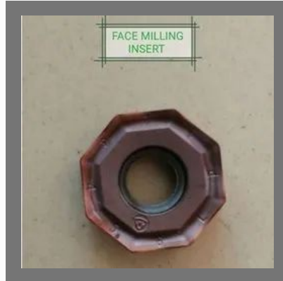
Face Milling Insert