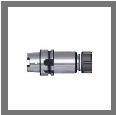
ER Collet Holder