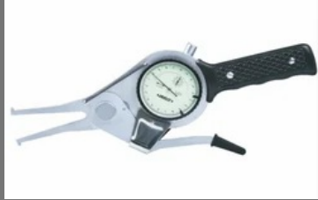
INTERNAL DIAL CALIPER GAGES