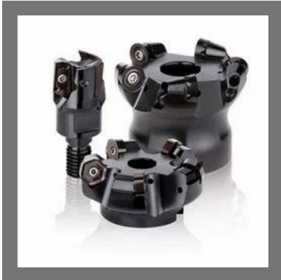
Profile Milling Cutter