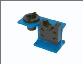
TOOL HOLDER LOCKER DEVICE