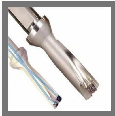
U Drill Bit