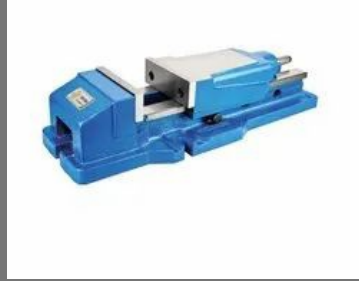
VMC Hydraulic Vise