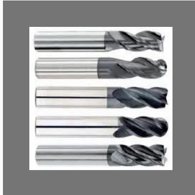
Solid Carbide End Mill