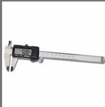
Digital & Analog Calipers