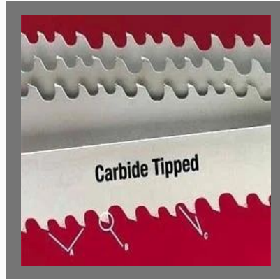
Metal Cutting Band Saw Blade