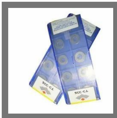
ZCC.CT Cutting Tools