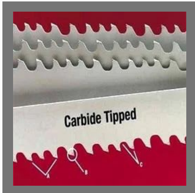
Band Saw Blade