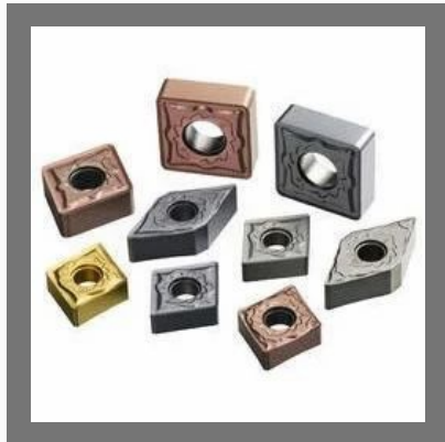
ISO Turning Insert