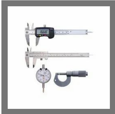
Mitutoyo & Insize Measuring Instruments