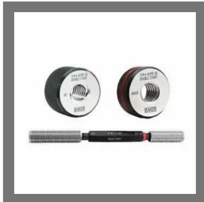
Multi-Start Thread Gauges