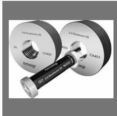
ACME Thread Gauges