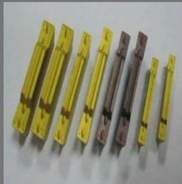
Grooving & Parting Insert