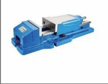
Hydraulic Machine Vise