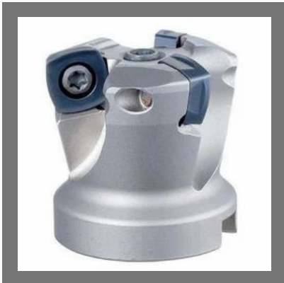
High Feed Milling Cutter & inserts