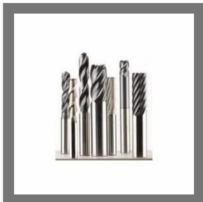
Carbide Cutting Tool