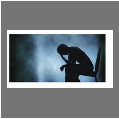
Major Depressive Disorder