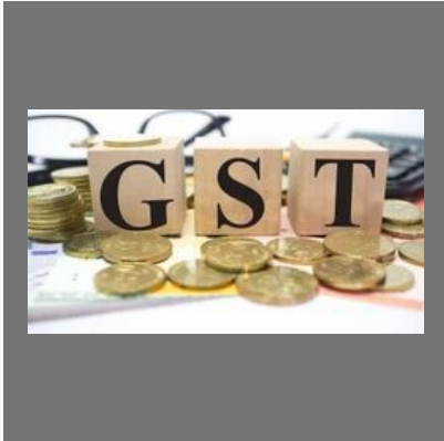
Goods And Service Tax Consultant