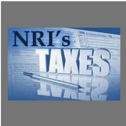
NRI Tax Services