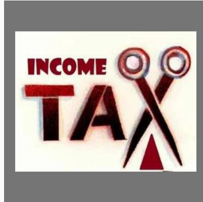
Income Tax & TDS Consultancy