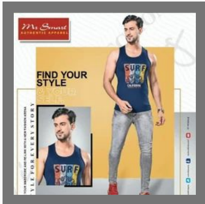
Men's Sando T-shirt