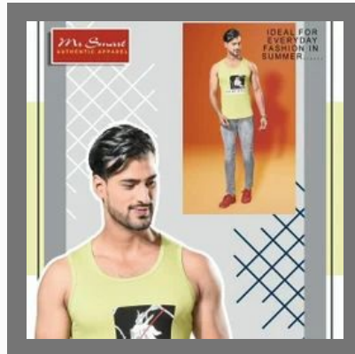
Men Fancy Sando's