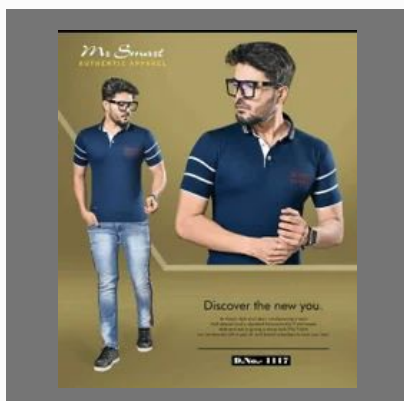
Fancy kollar half selevs