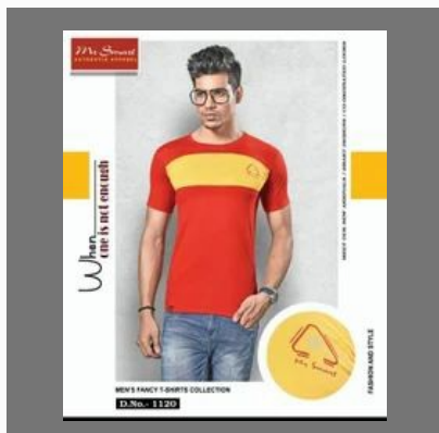
Men Round Neck T Shirt