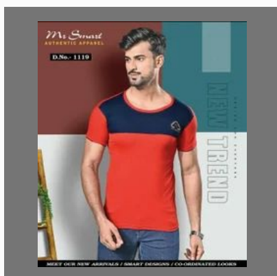
Mens Fancy Round Neck Half Sleeve T Shirt