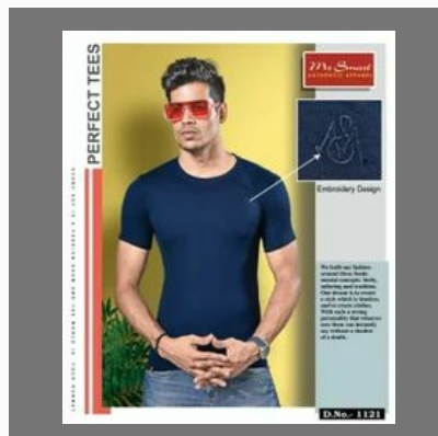
Men's Round Neck T Shirt