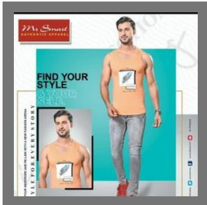
Fancy sando T-shirt