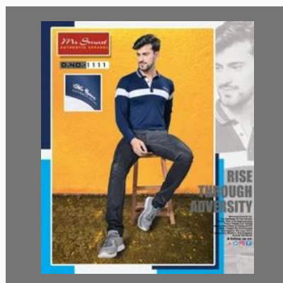
Mens kollar full selevs T-shirt