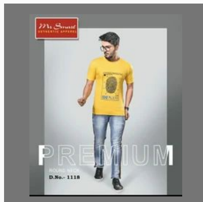
Mens Fancy Round Neck Half Sleeve T Shirt