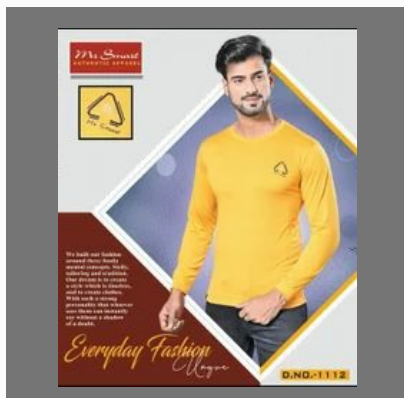
Mens Tshirts Full Selevs