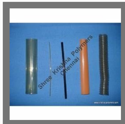
PEEK Heat Shrink Tubing