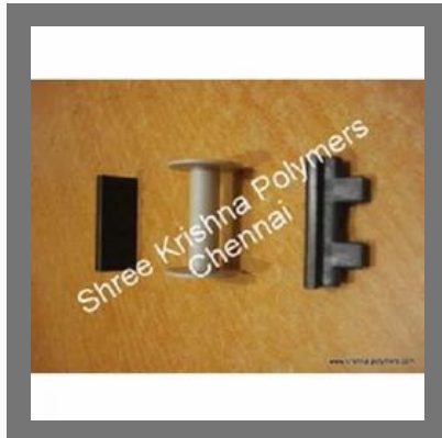
PEEK Moulded Components