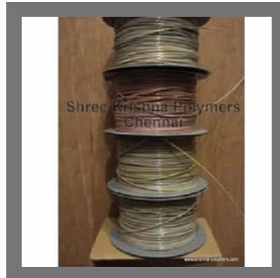
PEEK Tubing (HPLC)