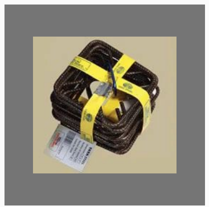
Superlinks TMT Bar