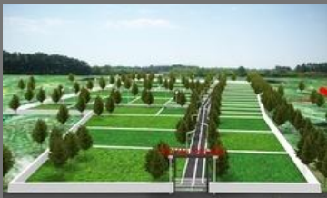
Royal Palm Construction Service