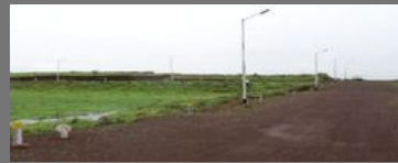
Farm House Plots