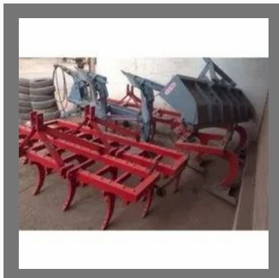
Heavy Duty Spring Loaded Cultivator