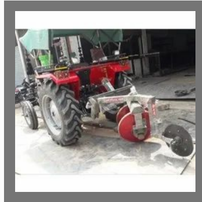
Angle Disc Plough