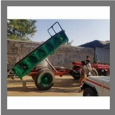
Green Tractor Trolley