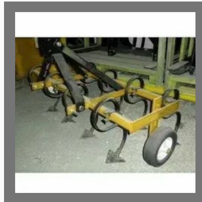
Agriculture Tractor Cultivator