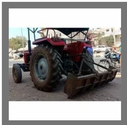
Tractor Land Leveler