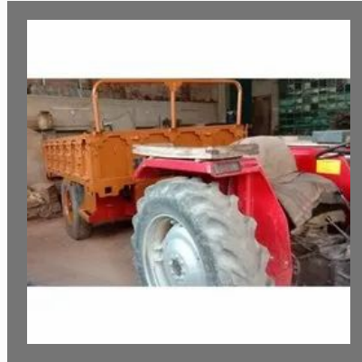
Hydraulic Tractor Trolley