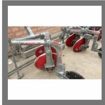
Mounted Disc Plough