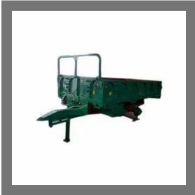
Agricultural Tractor Trolley