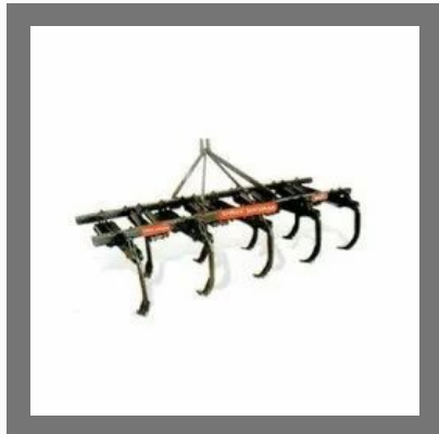
Agriculture Spring Loaded Cultivator