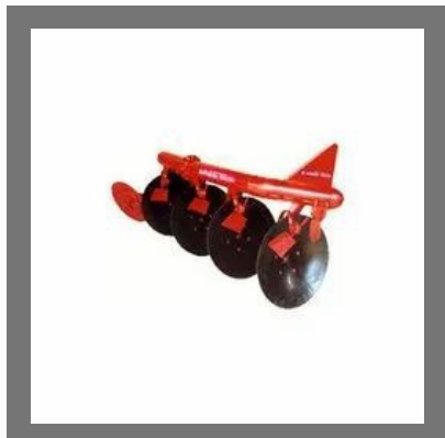
Reversible 2 Furrow Disc Plough