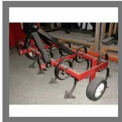
4 Tynes Loaded Cultivator