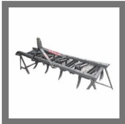
Agriculture Crop Cultivator