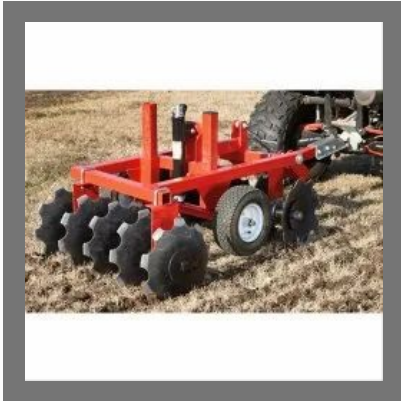
Harrow Disc Plough