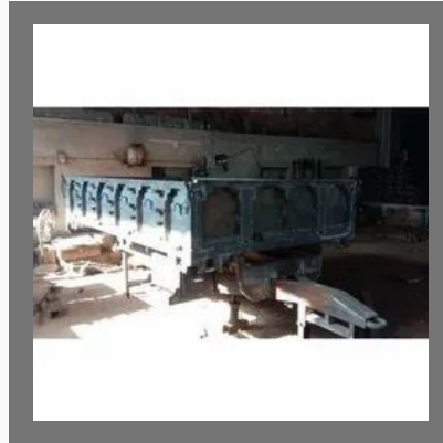
Blue Tractor Trolley