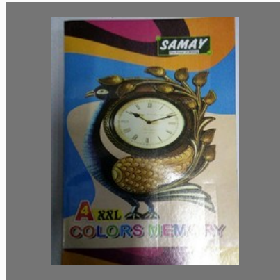
Rough Note Book