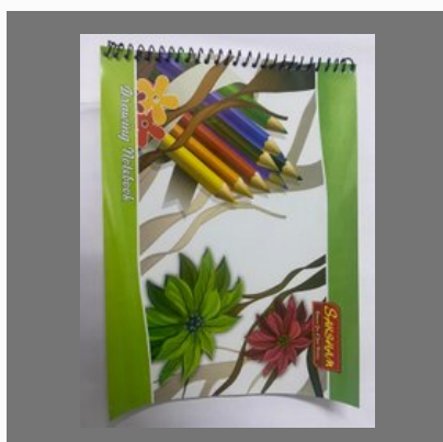
Saksham drawing sketch book