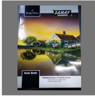
King Size Notebook