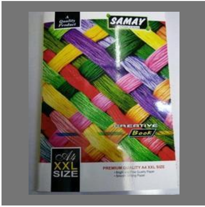
A4 Xxl Notebook