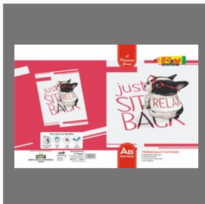
Harshil A6 Size Notebook