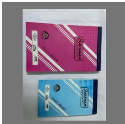
Saksham bill book/cash memo