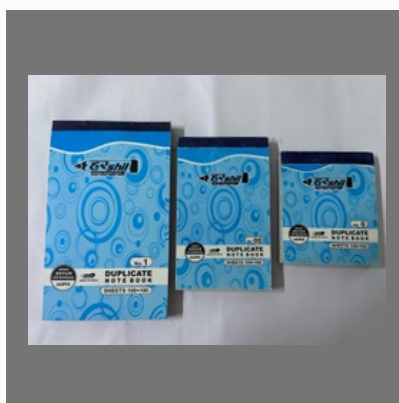
Harshil Duplicate Note Book