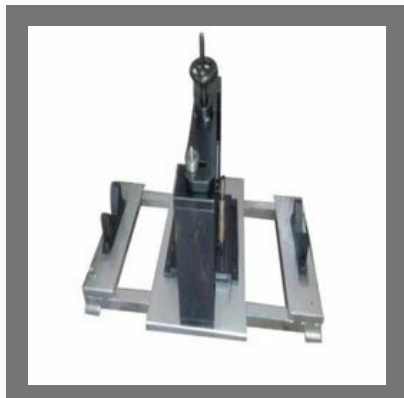
Industrial Welding Fixture