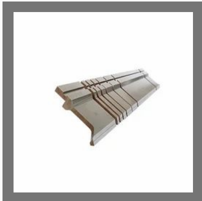
Press Brake Punch