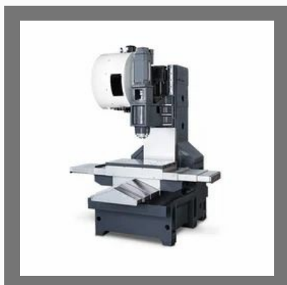
Vertical Machining Center