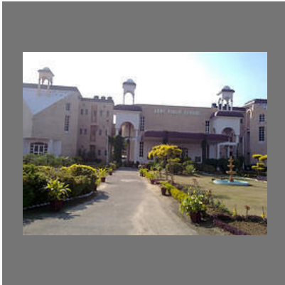
Army Public School Jalandhar Projects