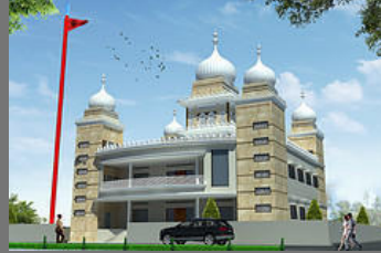
Gurudwara Urban Estate Projects