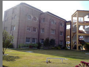
Army Public School Jalandhar Projects