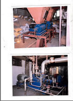
Mittal Udyog Projects