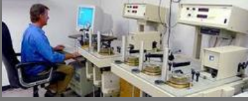
Geotechnical And Testing