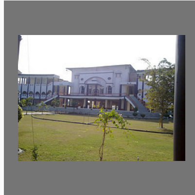
Army Public School Jalandhar Projects