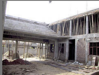
HMV Jalandhar Projects