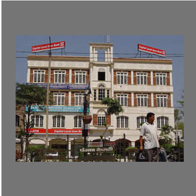
Capital Bank Projects