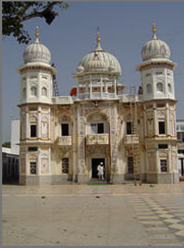
Raja Sahib Projects