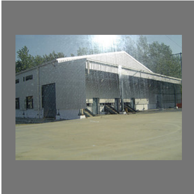
Factory Shed Projects