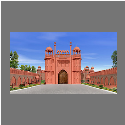
Bath Castle Jalandhar Projects