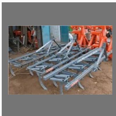
Agricultural equipment Job