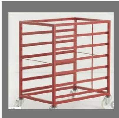
Material Handling Hanging Material Trolley