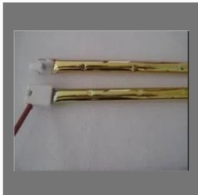
short wave infrared lamp