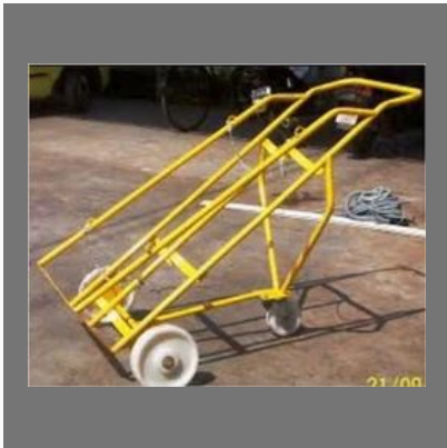
Cylinder Carring Trolley