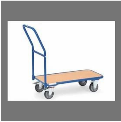
300 Kg Trolley