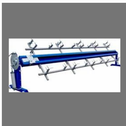
Jigs And Fixture