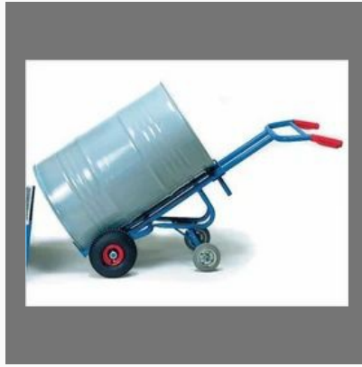
Drum Carrier Trolley