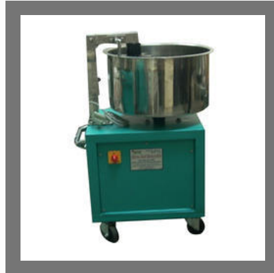
Atta Kneading Machine