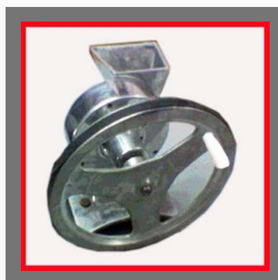
Pista Chips Cutting Machine