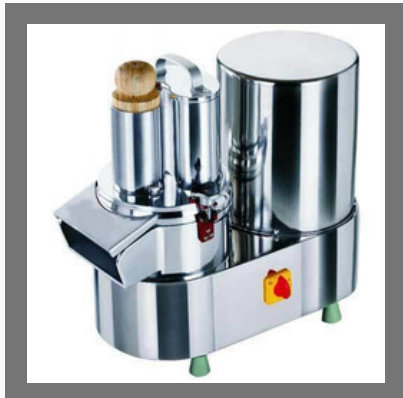
Vegetable Cutting Machine