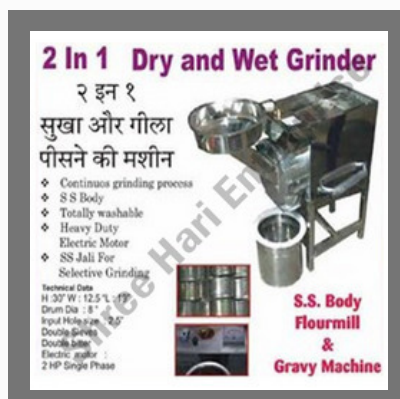
2 In 1 Dry & Wet Grinder