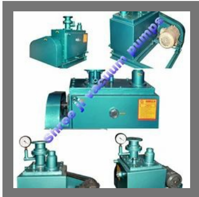
Oil Sealed High Vacuum Pumps