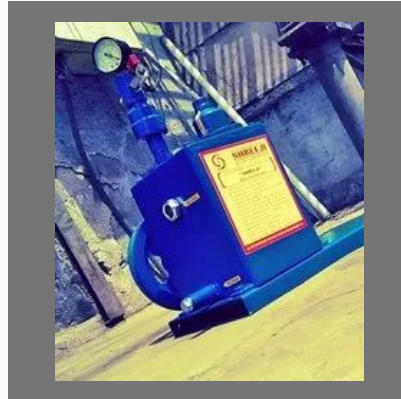
Laboratory Cast Iron Vacuum Pumps