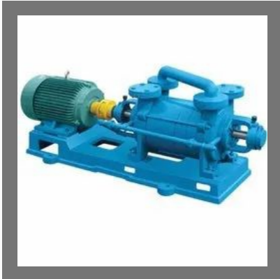
Two Stage Watering Vacuum Pumps