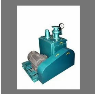
10000 Lpm Oil Seal High Vacuum Pump