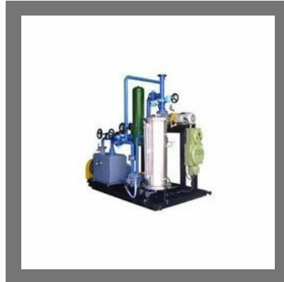
High Vacuum Systems