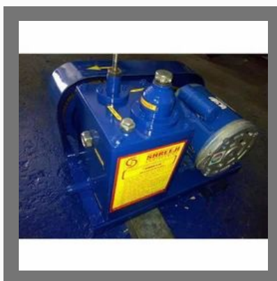
Laboratory Vacuum Pump