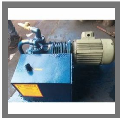
Rotary Vane Vacuum Pump Important Type