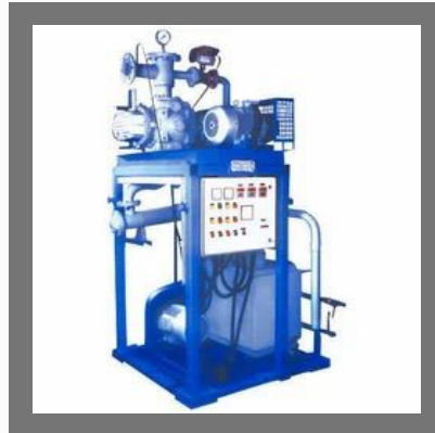
Vacuum Booster System