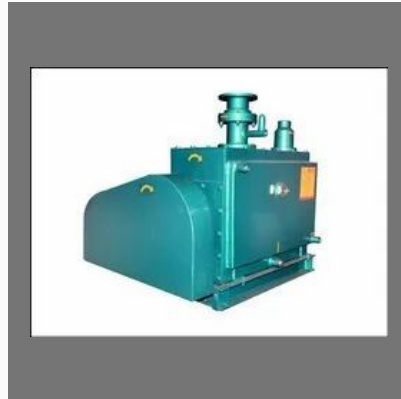
Oil Seal High Vacuum Pump