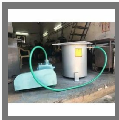
Resin Impregnation Vacuum System