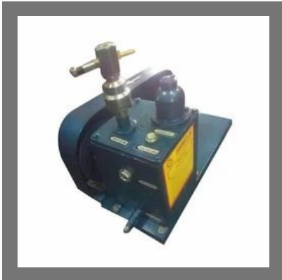
Laboratory High Vacuum Pump