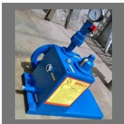
Lab Vacuum Pump