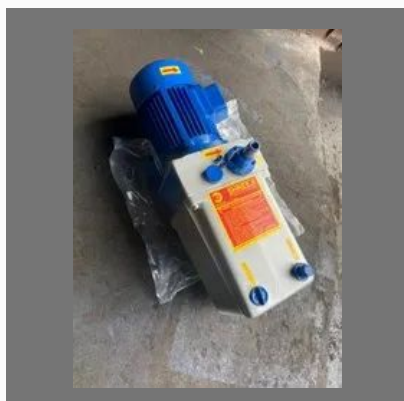
Direct Drive High Vacuum Pumps