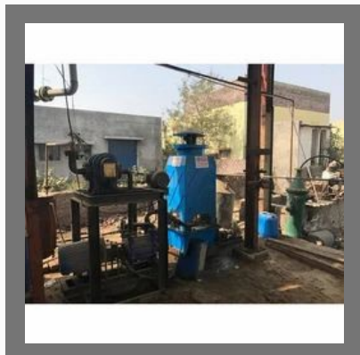
Distillation Vacuum Plant