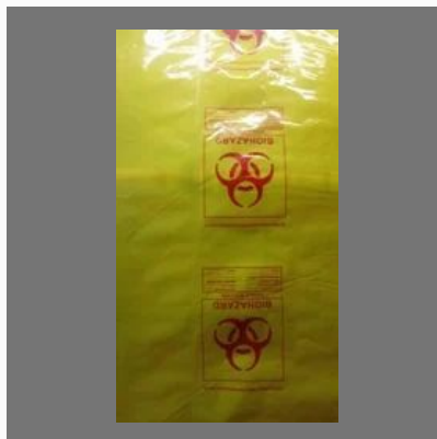
Autoclavable Poly Bags