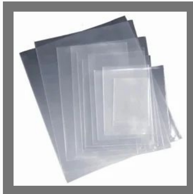
Ldpe Plastic Bag