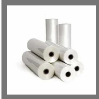
Ldpe Film Roll