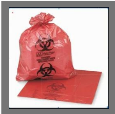
Bio-Hazardous Medical Waste Bag