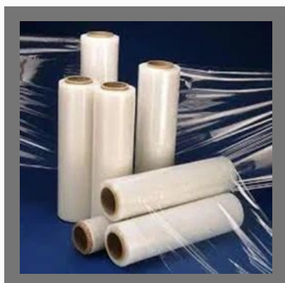
Ldpe Shrink Film Roll