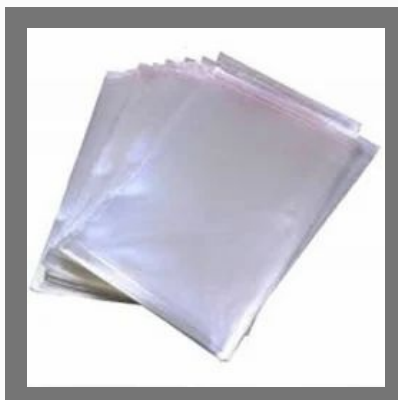
Transparent Ldpe Plastic Bags