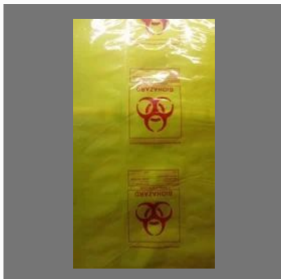
Bio Medical Garbage Bag