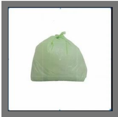
Compostable Garbage Bag