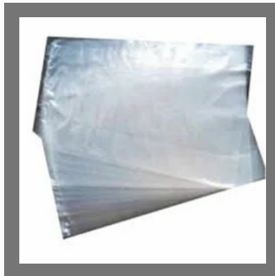
Transparent Ldpe Bags