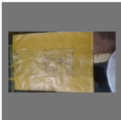
Printed Garbage Bag