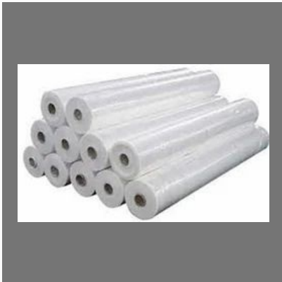
Ldpe shrink roll