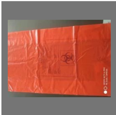
Compostable Biodegradable Bag