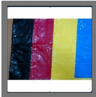
Colored Garbage Bag