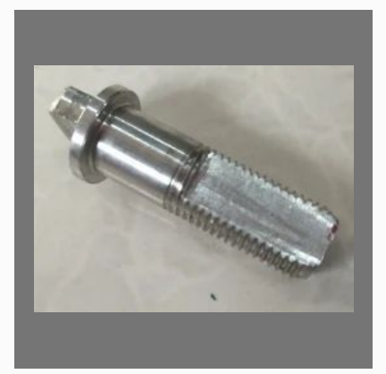
316 Grade 1 Inch Stainless Steel Valve Spindle