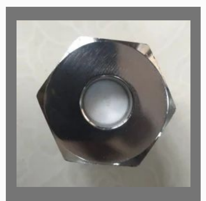
Stainless Steel Vacuum Valve