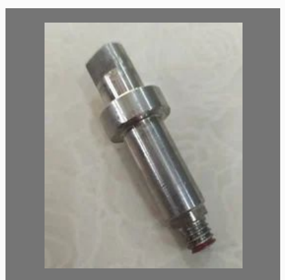
316 Grade 3/4 Inch Stainless Steel Valve Spindle