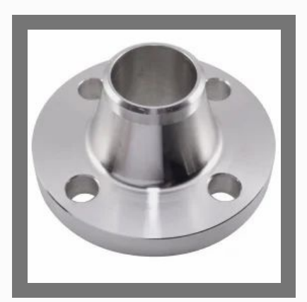
Welding Neck Flanges