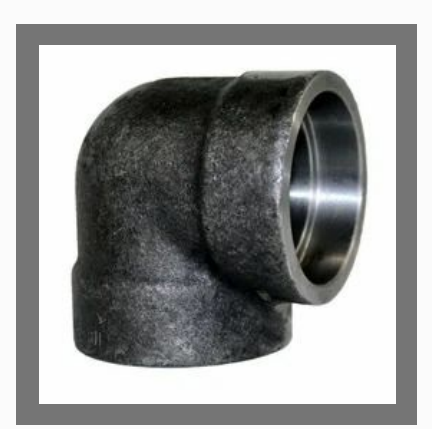
Stainless Steel Socket Weld