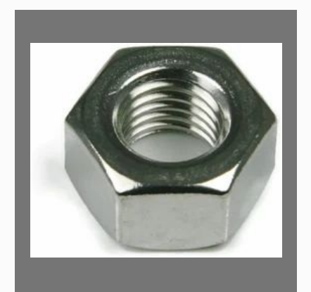
Stainless Steel 304 Hex Nut