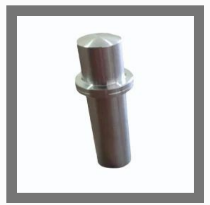
Stainless Steel Ball Valve Pin