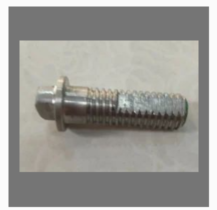
304 Grade Stainless Steel Valve Spindle