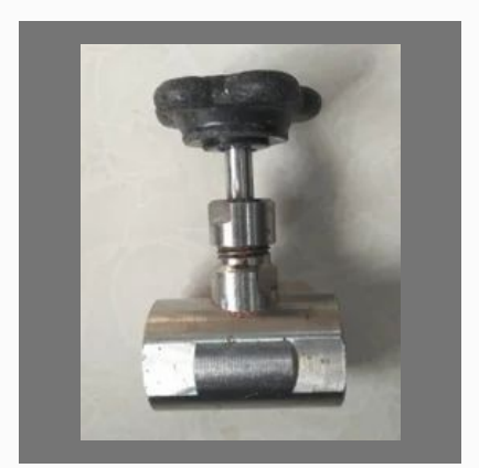
1/2 inch Stainless Steel Needle Valve