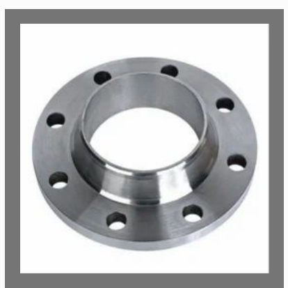
Stainless Steel Threaded Flange