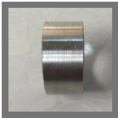
Stainless Steel Cable Glands