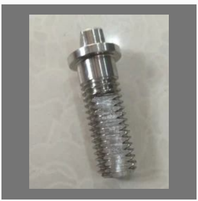
202 Grade 1 Inch Stainless Steel Valve Spindle