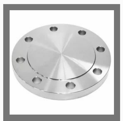
Forged Blind Flange