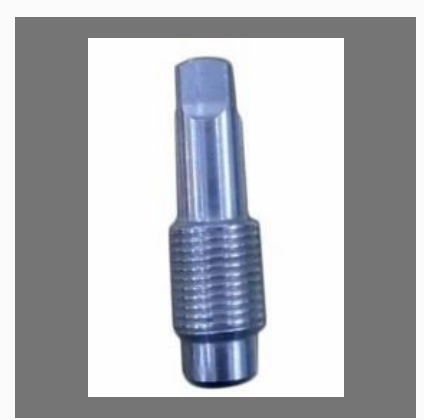
Stainless Steel Blue Gas Valve Spindle