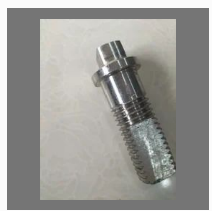
305 Grade Stainless Steel Valve Spindle