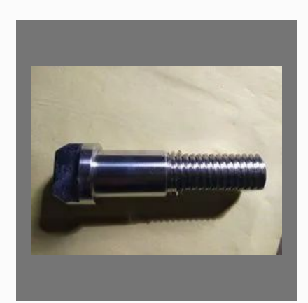
2 Inch Brass Ball Valve Pin