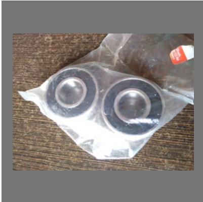
Automotive Ball Bearings