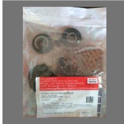
Timing Chain Kit