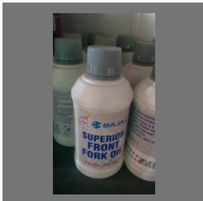
Front Fork Oil