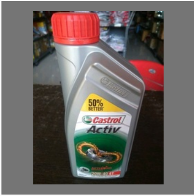
Castrol Bike Engine Oil