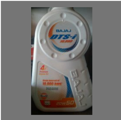
Two Wheeler Engine Oil