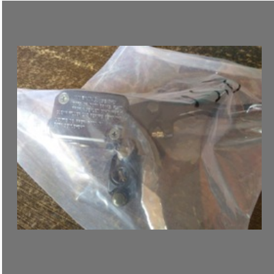
Bike Disk Brake