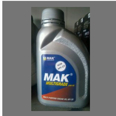
MAX Engine Oil