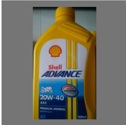
Car Engine Oil