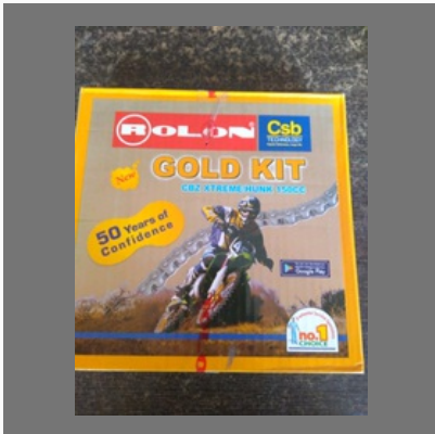
Bike Chain Kit