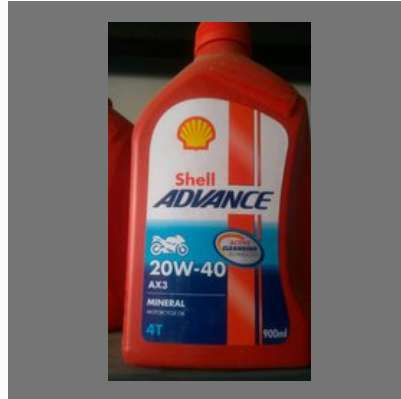
Shell Advance Engine Oil