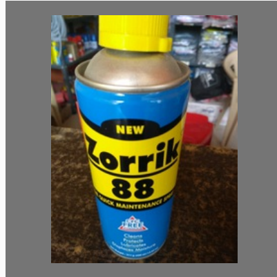
Bike Maintenance Spray