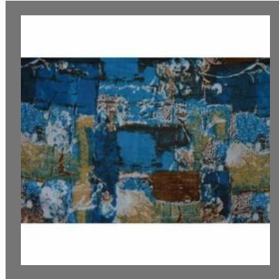
Printed Cotton Fabric