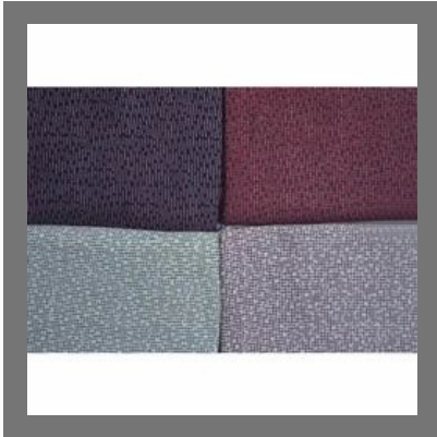
Cotton Textile Fabric