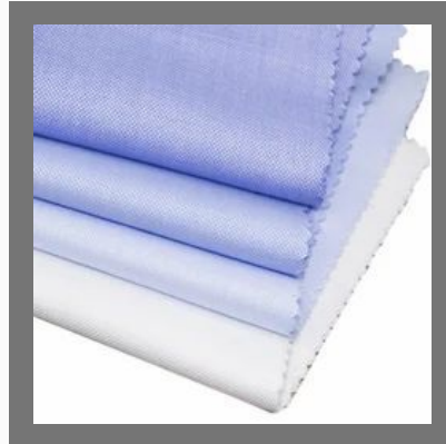
Cotton Shirting Fabric