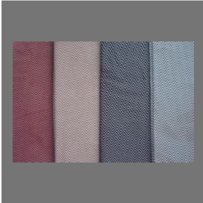
Cotton Printed Fabric