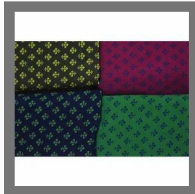
Cotton Printed Fabric