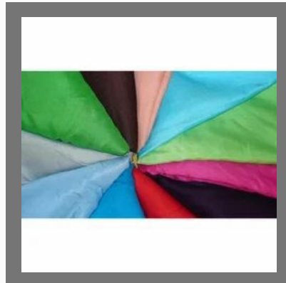
Plain Rayon Fabrics