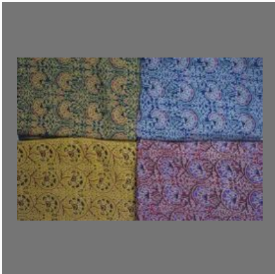
Cotton Printed Fabric