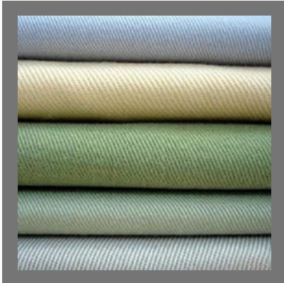
Cotton Cambric Fabric