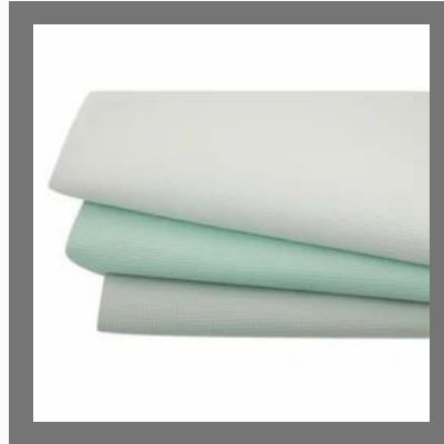
Plain Cotton Fabric