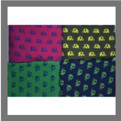
Printed Cotton Fabric