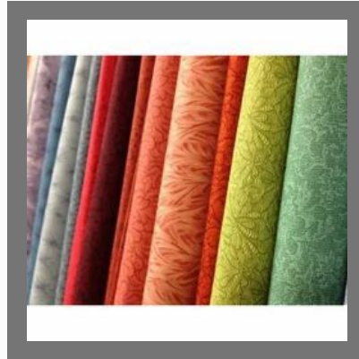
Cotton Dress Fabric