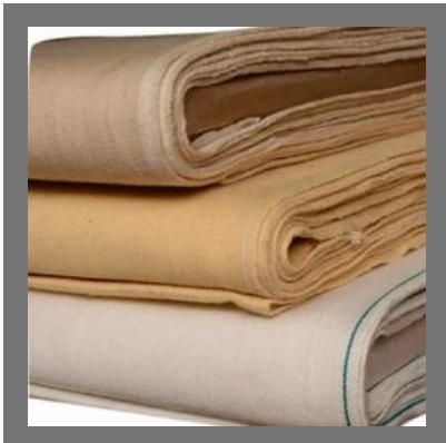
Plain Khadi Fabric