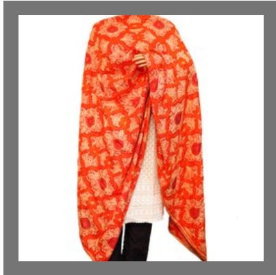
fancy designer phulkari dupatta