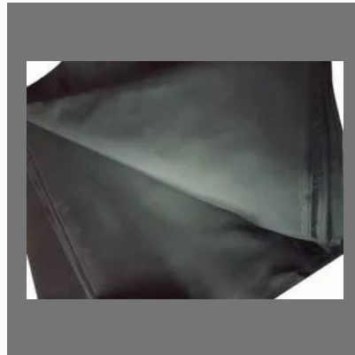
Plain Micro Fabric