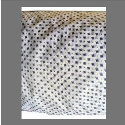
Fancy Pocketing Printed Fabric