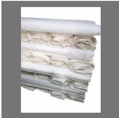
Roto Off White Fabric