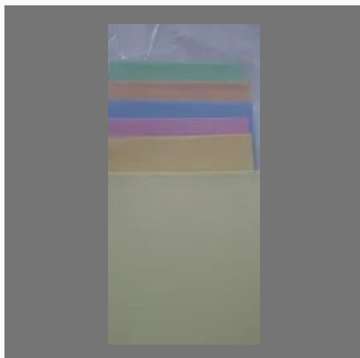
Carry Bag Fabric