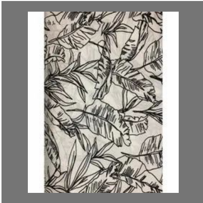
Fancy Pocketing Fabric