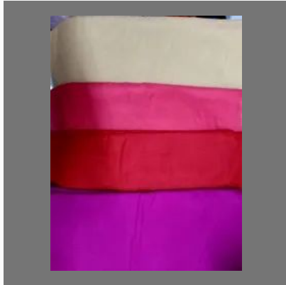
Dyed Roto Fabric