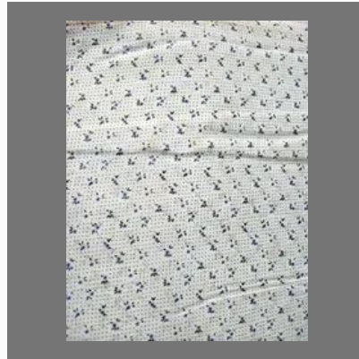
Pocketing Printed Fabric