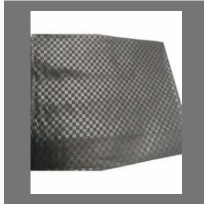
Pocketing Emboss Fabric