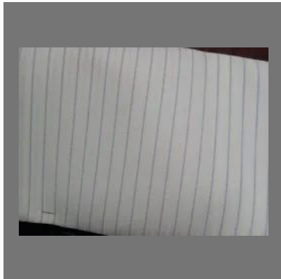
Hiring Bone Blue Lining 58