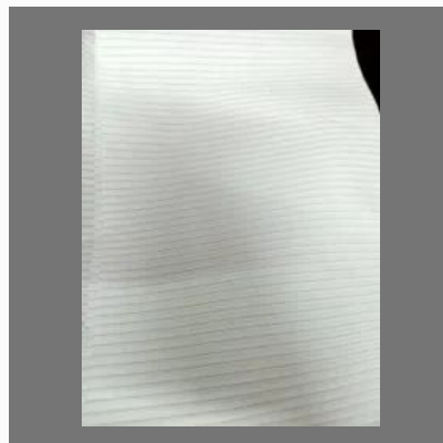
Polyester Plain Fabric