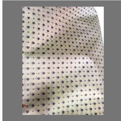
Designer Pocketing Fabric