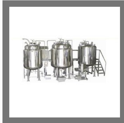
Liquid Syrup Manufacturing Plant