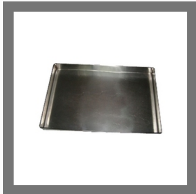
Stainless Steel Tray for Dryer