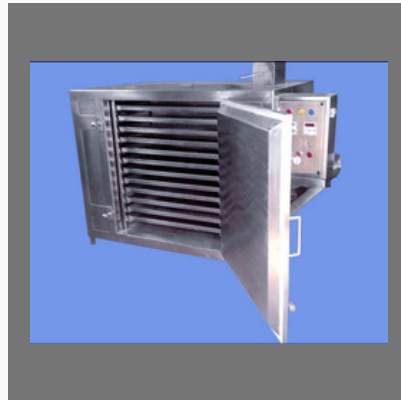
Stainless Steel Tray Dryer