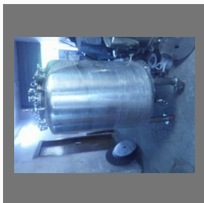
Fabricated Chemical Storage Tank