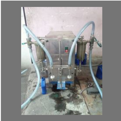
Liquid Filling Machine