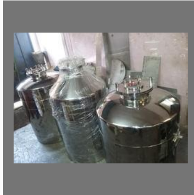
Sterile Filtration Pressure Vessel & Filling Vessel