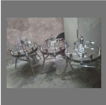
Membrane Filter Holder