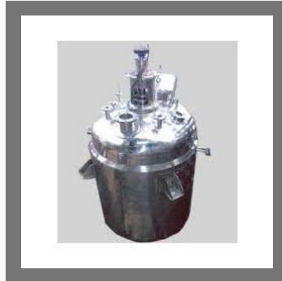
Jacketed Reaction Vessels