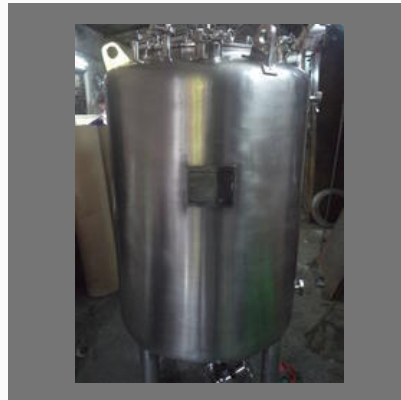
Blending Storage Tank