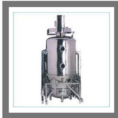
Fluid Bed Dryers