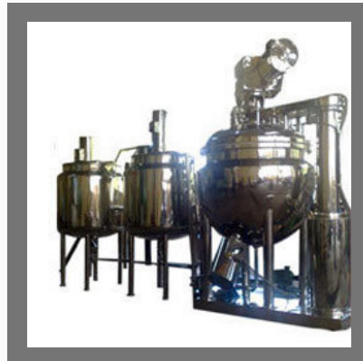
Lotion and Shampoo Mixer