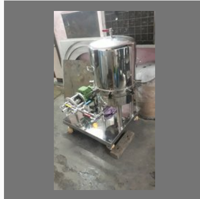
Zero Holdup Filter Press(14" x 10plate)