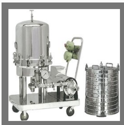
Zero Holdup Filter Press