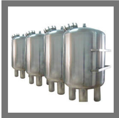
S S Liquid Mixing Tanks