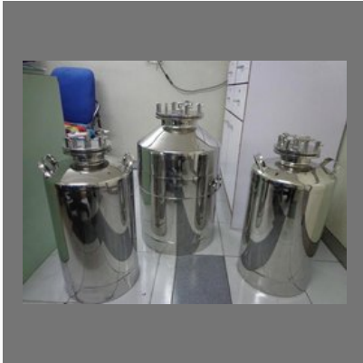
Pressure Vessel SS 316l 100ltrs