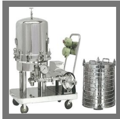
Zero Hold Up Filter Press