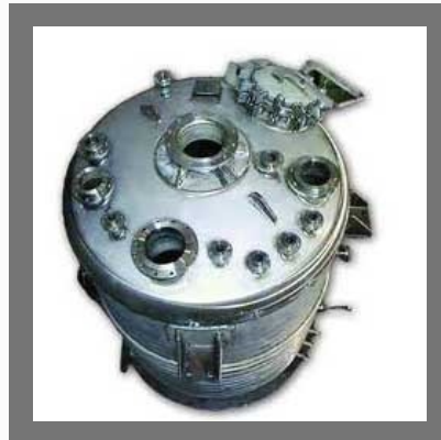
Chemical Reactor Vessel