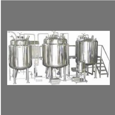
Fully Automatic Syrup- Suspension Manufacturing Plant