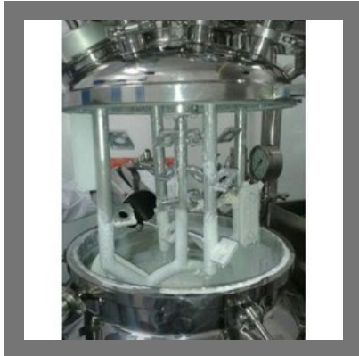
Semi Contra Mixer