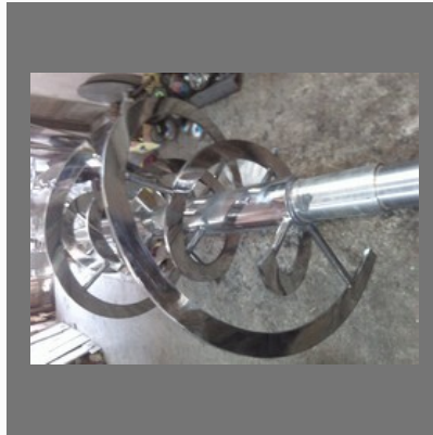
Ribbon Blade In Two Parts