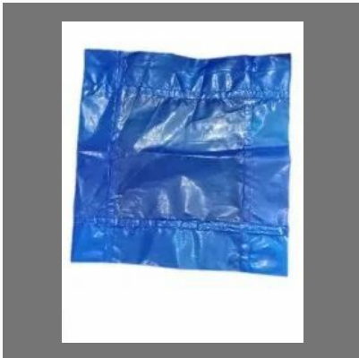
PVC Tarpaulin Sheet