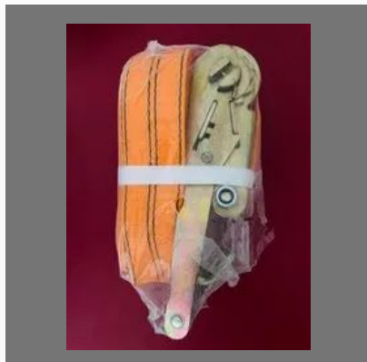
Cargo Ratchet Belt