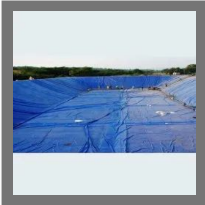
Blue HDPE Tarpaulin Sheet