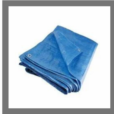
Blue HDPE Tarpaulin Sheet