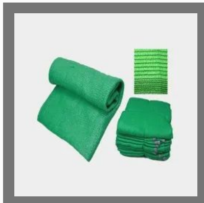
Green Mesh Shade Net