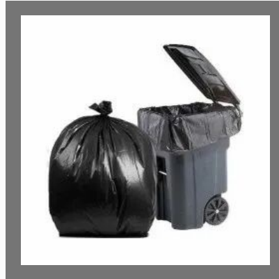
Biodegradable Garbage Bag