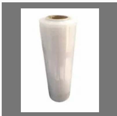
Stretch Wrapping Film