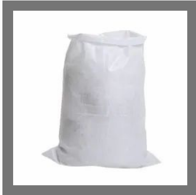
HDPE Woven Sack Bag