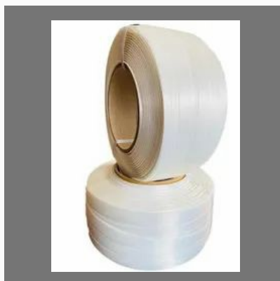
Polyester Composite Corded Strap