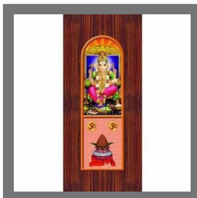
Designer Paper Lamination Door