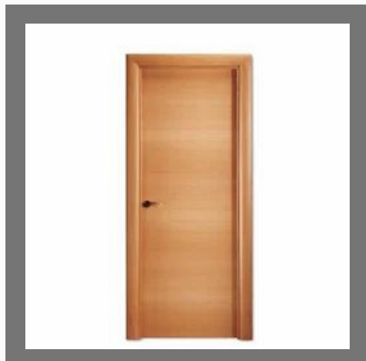
Wooden Flush Door