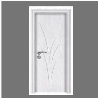
White HDF Door