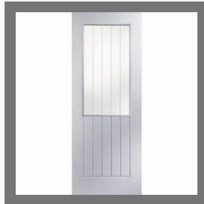
White Interior Moulded Door