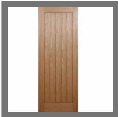
Veneer Main Door