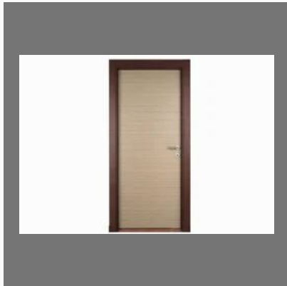
Modern Veneer Door