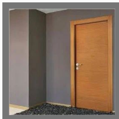
Calibrated Flush Door