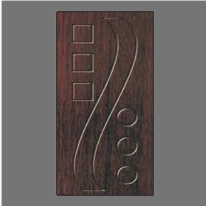
PVC Membrane Door