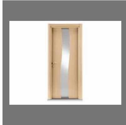
Designer Laminated Door