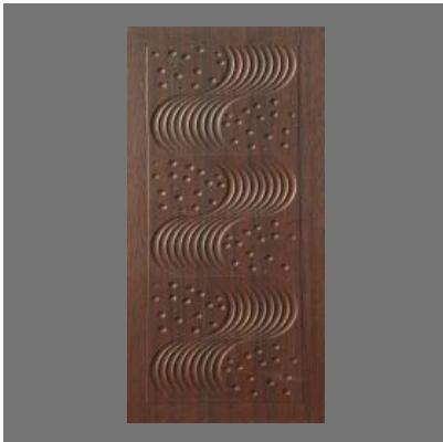
Designer Membrane Door