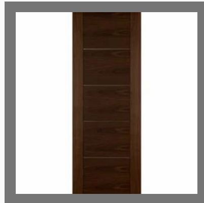
Teak Veneer Door