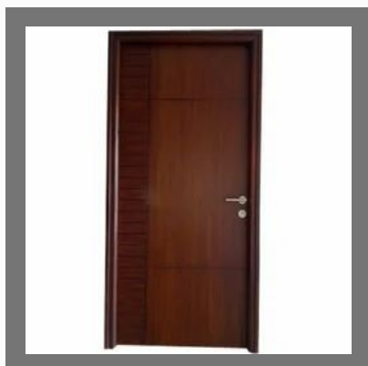
Interior Flush Door