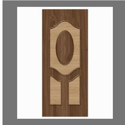
PVC Membrane Door