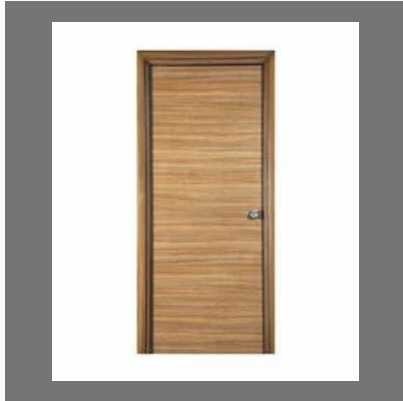
Texture Laminated Door