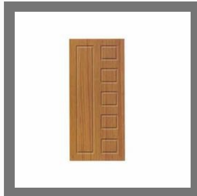
Office Membrane Door