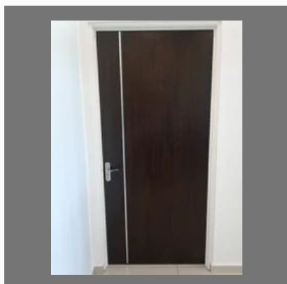
HDF Interior Door