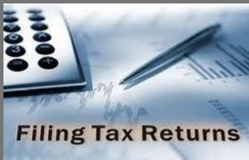
It Return Processing Service