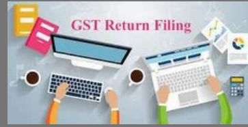
Gst Return Fill