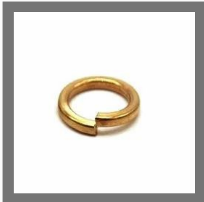
Brass Spring Washers