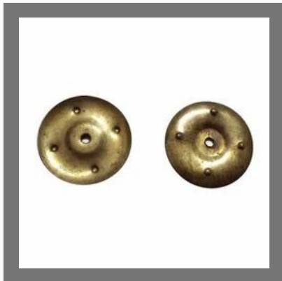
Brass Pressed Components