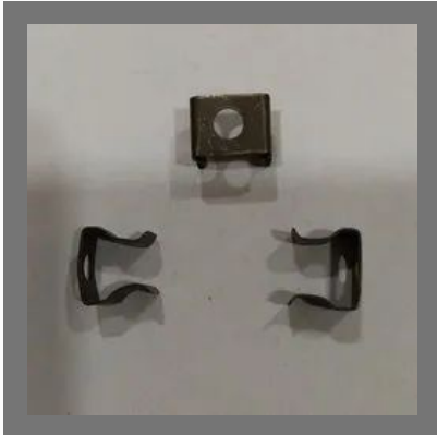
Copper Electrical Components