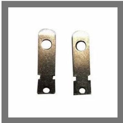
Brass Switchgear Components