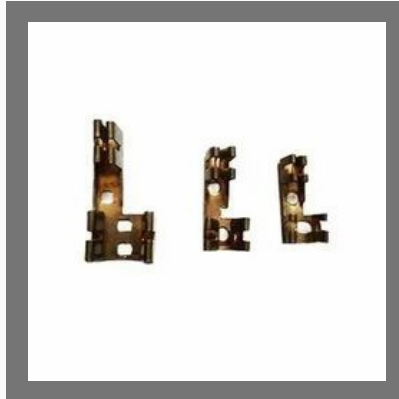
Copper Fuse Component