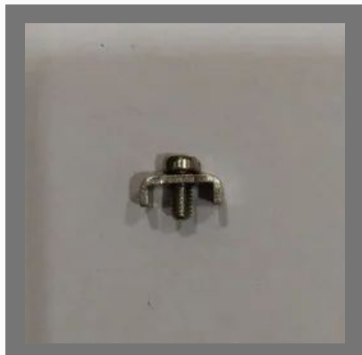
Brass Sheet Cutting Component