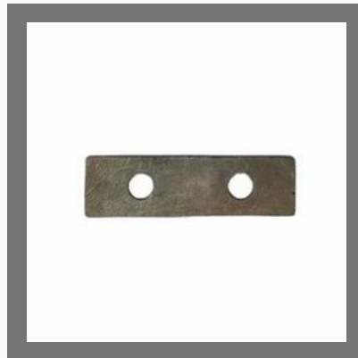
Precision Brass Sheet Metal Components