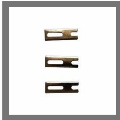
Brass Electrical Components