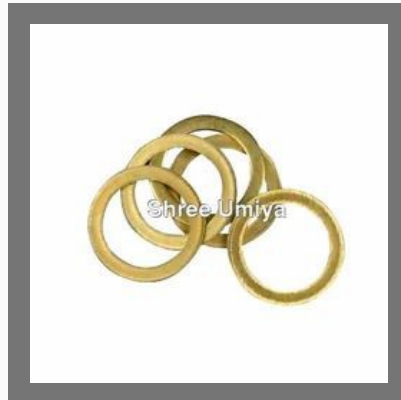
Plain Brass Washers