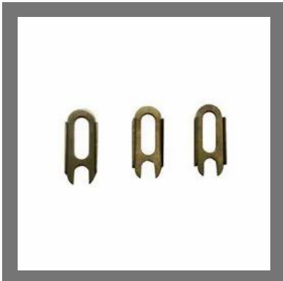
Precision Copper Sheet Metal Components