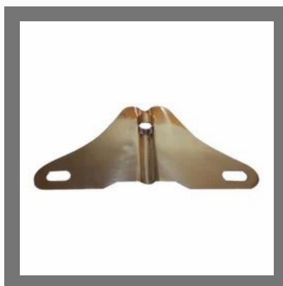
Butterfly Toilet Jet Bidet