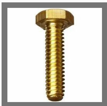
Full Thread Brass Bolts