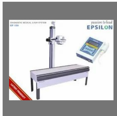
EP 100 Diagnostic Medical X Ray Machine