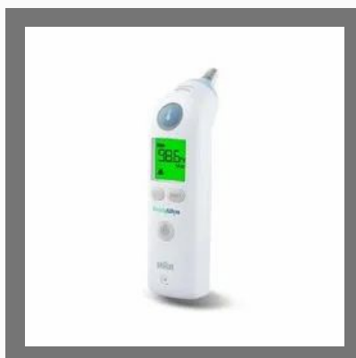
Welch Allyn Braun ThermoScan PRO 6000 Ear Thermometer