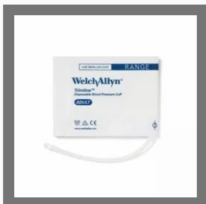
Trimline Disposable Blood Pressure Cuff