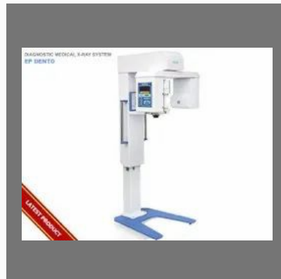
EP Dento Diagnostic Medical X Ray Machine