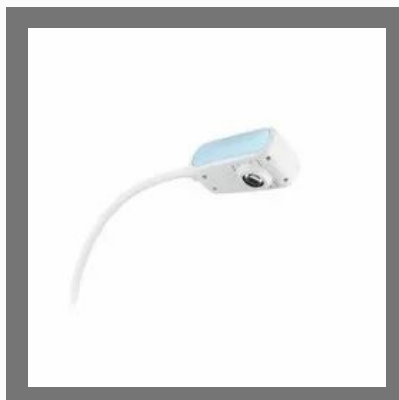
Welch Allyn Green Series 300 General Exam Light