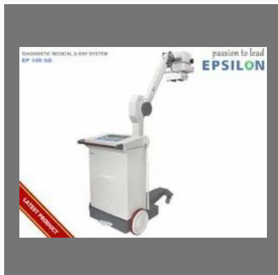
EP 100 SB Medical X Ray Machine