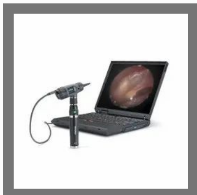
Welch Allyn Digital MacroView Otoscope