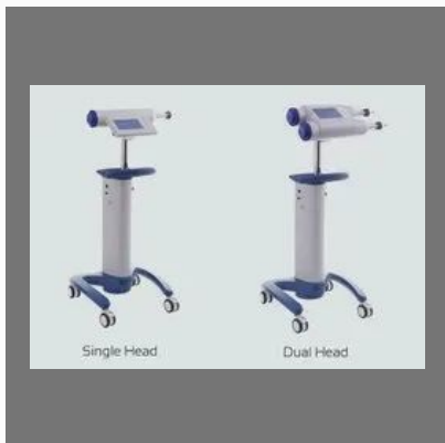
Sequoia Healthcare Pvt.ltd- CT Dual Head / Single Head