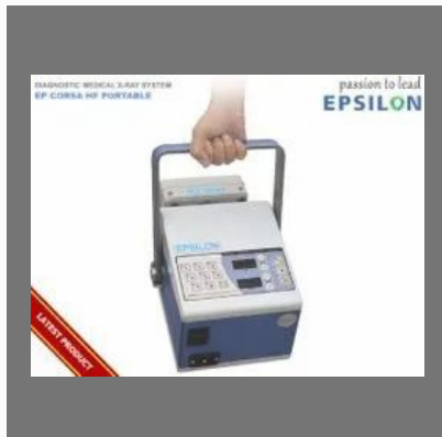
EP Corsa HF Portable X Ray Machine