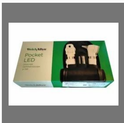
Hillrom Welch Allyn 2.5V Pocket LED Black Ophthalmoscope