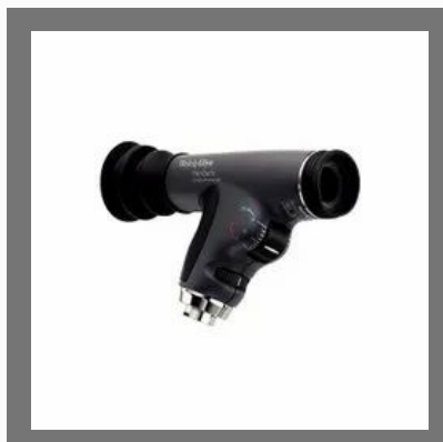
Welch Allyn PanOptic Ophthalmoscope