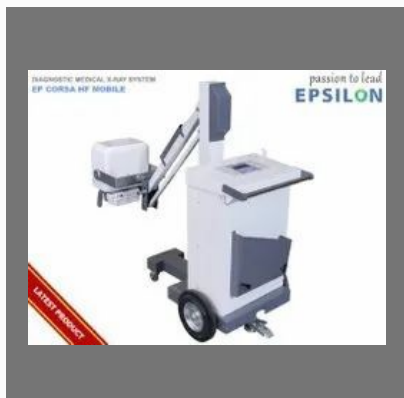
EP Corsa HF Mobile X Ray Machine