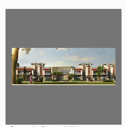
Swastik Grand Villas Construction