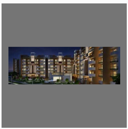
Swastik Grand Construction