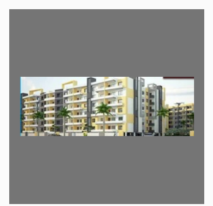
Swastik Paras Enclave Construction