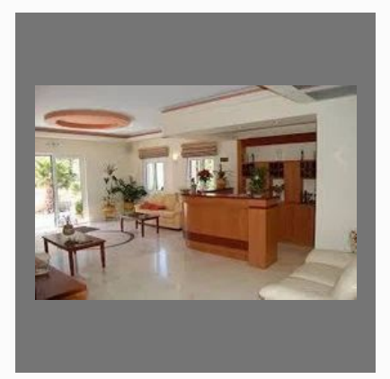
2 Bhk Apartments