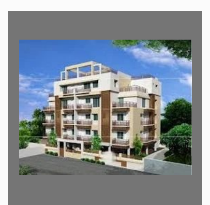
3 Bhk Apartments