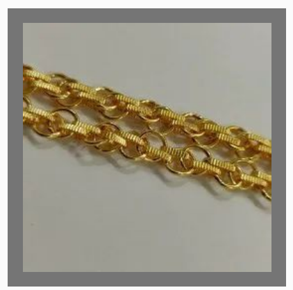
Artificial Handmade Chains