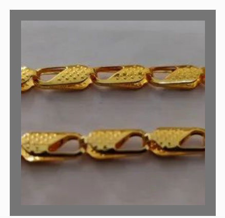
Imitation Neck Chain