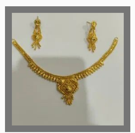
Artificial Necklace Set