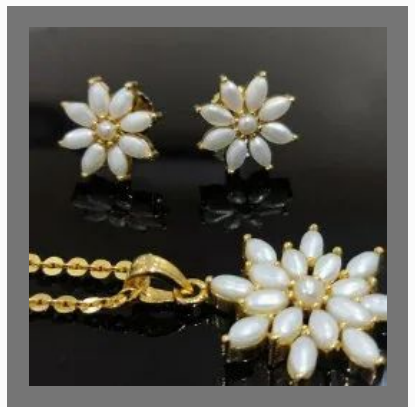
Artificial Chain Pendant Set